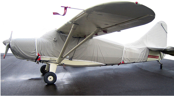
Stinson 108 Canopy, Engine, Prop & Empennage Covers

The material is very reflective, and tests show that the cabin interior temperature can be reduced to near-ambient temperature on the hottest of days. It is water, ice and snow repellent, yet breathable to allow moisture to escape from between the cover and the aircraft surface.