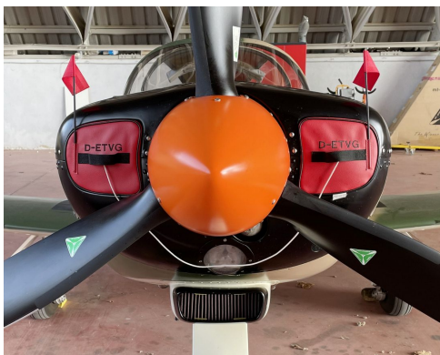
Marcheti SF260C Inlet Plugs

Engine Inlet Plugs are custom fit for your Siai Marchetti SF260 intakes, made with heavy-duty vinyl material, and stuffed with a single block of sculpted urethane foam. Each plug has a zipper that allows the foam to be removed and dried if necessary. Engine plugs have warning flags that are visible from the cockpit or 'remove before flight' streamers sewn onto the face of the plugs. Most plugs are imprinted with the aircraft registration number in black for an extra charge. Storage bag NOT included. Engine plugs may be inserted after flight when the engine is still warm. Engine Inlet Plugs are commonly referred to as Cowl Plugs, Intake Plugs, Cowl Blocks, Engine Blocks, and Engine Bungs.