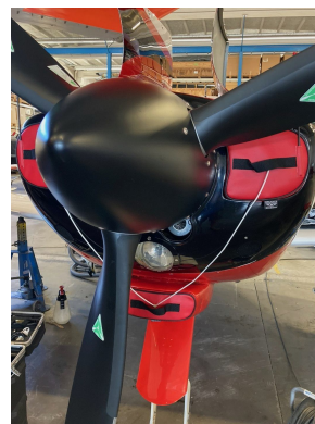
Siai Marchetti SF260 Engine Plugs