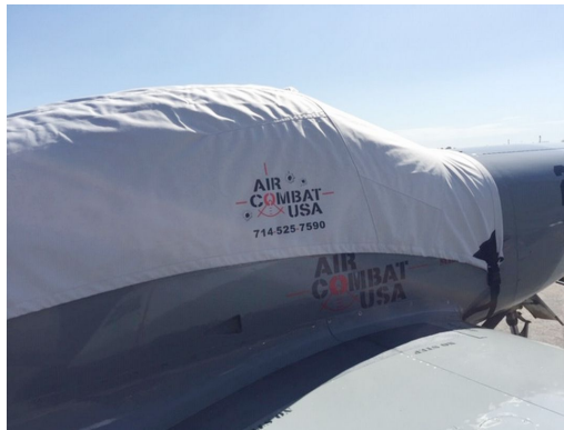
1974 Siai-Marchetti SF 260B Canopy Cover with customized Imprint