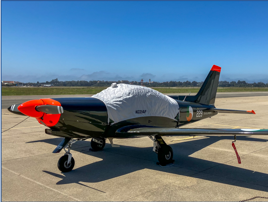
Siai Marchetti SF260 Canopy Cover