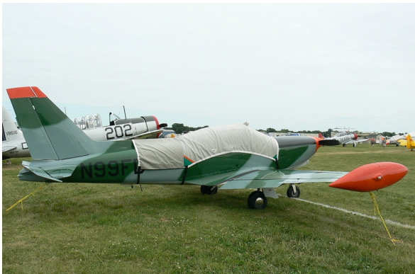
Siai Marchetti SF260 Canopy Cover with aft extension

This cover type is made from Silver Acrylic Sunbrella canvas and is 100% lined with a soft and smooth microfiber. Bruce's Custom Covers developed this material combination especially for aircraft protection. The outer material is medium weight and treated for water resistance, UV resistance and anti-static buildup. The inner lining is a very soft and smooth microfiber to prevent scratching. The material is very reflective, and tests show that the cabin interior temperature can be reduced to near-ambient temperature on the hottest of days. It is water, ice and snow repellent, yet breathable to allow moisture to escape from between the cover and the aircraft surface.