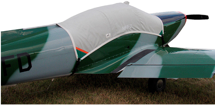
Standard Canopy Cover

Travel Covers are made with Silver Solution-Dyed Polyester fabric and only lined over the windshield to save weight. The material is lightweight and more compact for easy stowage in the aircraft. The polyester material is water resistant, but only intended for occasional use outside. We also have an ultra lightweight material available for fitted hangar dust covers. For daily outdoor use, the non-travel Sunbrella Cover is the best choice.