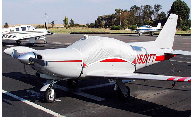
Standard Canopy Cover for Marchetti SF260