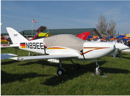
The Swearingen SX300 Canopy Cover