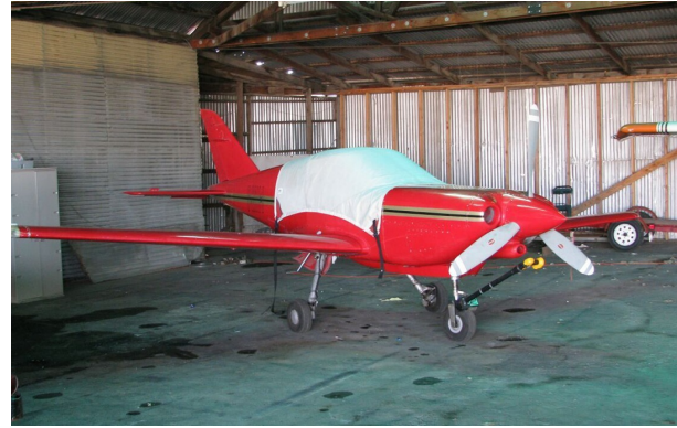
The Swearingen SX300 Canopy Cover