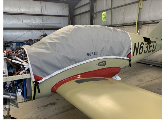
Swearingen SX300 Travel Weight Canopy Cover