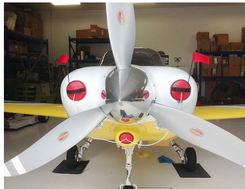
Swearingen SX300 Engine Inlet Plugs