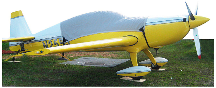
Xtremear Canopy Cover