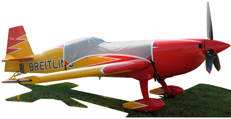
Extra 300sc Canopy Cover