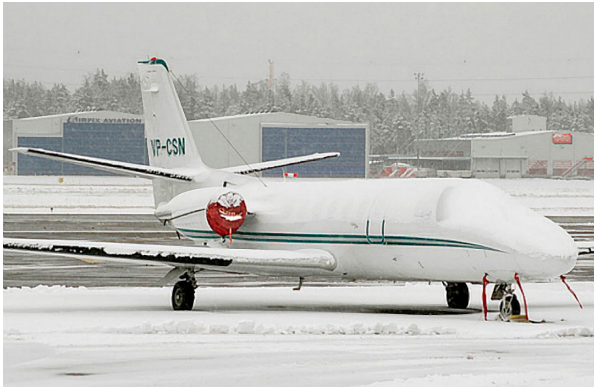
Cessna 560 Engine Inlet/Exhaust Covers, Pitot Cover Set

and dried if necessary. Engine plugs have 'remove before flight' streamers sewn onto the face of the plugs. Most plugs are imprinted with the aircraft registration number in black. Engine plugs may be inserted after flight when the engine is still warm. Engine Inlet Plugs are commonly referred to as Cowl Plugs, Intake Plugs, Cowl Blocks, Engine Blocks, and Engine Bungs.