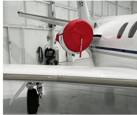
Cessna Citation S550 Intake/Exhaust Covers