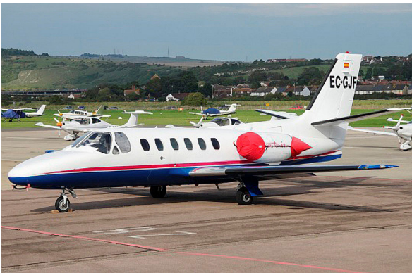
Cessna Citation II Engine Covers, Pitot Covers