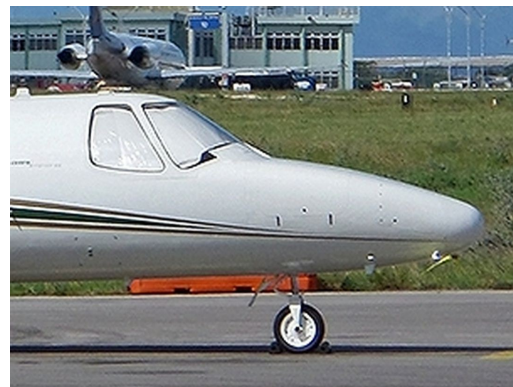
Cessna Citation S550 Cockpit HeatShields