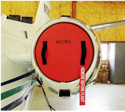
Cessna Citation S-550 Intake Plugs