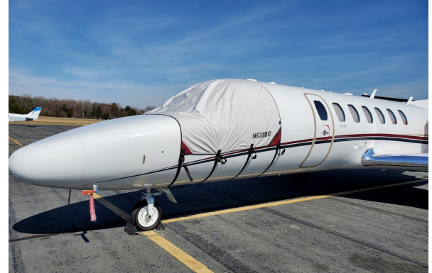
Cessna Citation S2 Cockpit Cover, Intake Covers & Exhaust Plugs