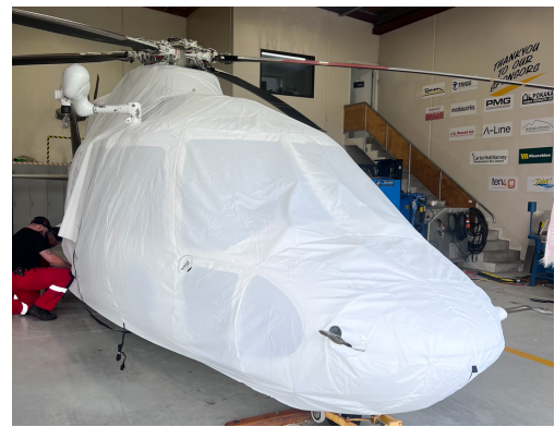
Sikorsky S76C Forward Canopy Cover, Engine Cover (test fit covers)