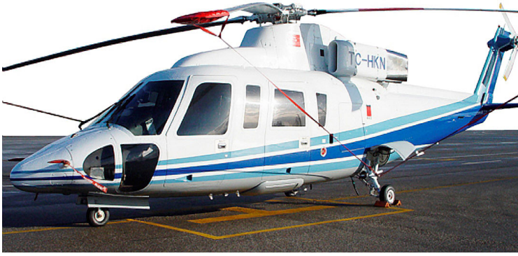
S76 Blade Tie-Downs and Pitot Cover set