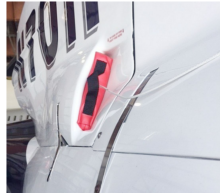
Sikorsky S76 (All Models) Intake Plugs (S76c Models)