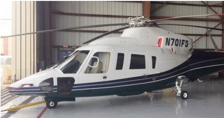
Sikorsky S76 (All Models) Intake Plugs (S76c Models)

The Engine Inlet Plugs are custom fit for your Sikorsky S76 (All Models) intakes, made with heavy-duty vinyl material, and stuffed with a single block of sculpted urethane foam. Each plug has a zipper that allows the foam to be removed and dried if necessary. Engine plugs have 'Remove Before Flight' streamers sewn onto the face of the plugs. Most plugs are imprinted with the aircraft registration number in black for an extra charge. Storage bag NOT included. Engine plugs may be inserted after flight when the engine is still warm. Engine Inlet Plugs are commonly referred to as Cowl Plugs, Intake Plugs, Cowl Blocks, Engine Blocks, and Engine Bungs.