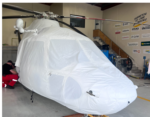
Sikorsky S76C Forward Canopy Cover, Engine Cover (test fit covers)

Travel Covers are made with Silver Solution-Dyed Polyester fabric and fully lined over the entire cover. The material is lightweight and more compact for easy stowage in the aircraft. The polyester material is water resistant, but only intended for occasional use outside. We also have an ultra lightweight material available for fitted hangar dust covers. For daily outdoor use, the non-travel Sunbrella Cover is the best choice.