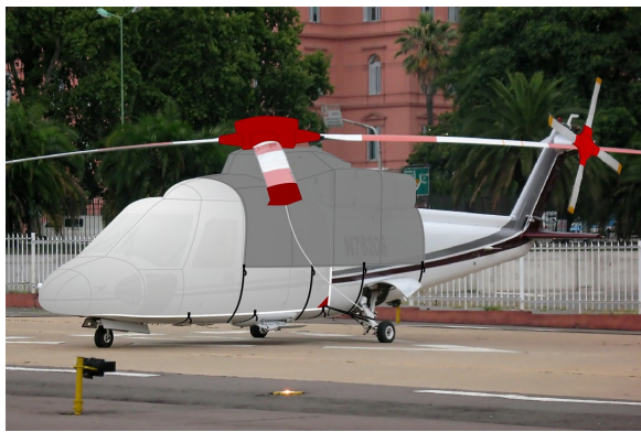
S76 Forward Fuselage, Engine, Main & Tail Rotor Hub Covers (illustration)