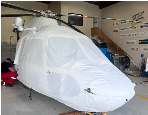
Sikorsky S76C Forward Canopy Cover, Engine Cover (test fit covers)