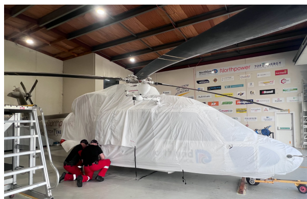
Sikorsky S76C Forward Canopy Cover, Engine Cover (test fit covers)