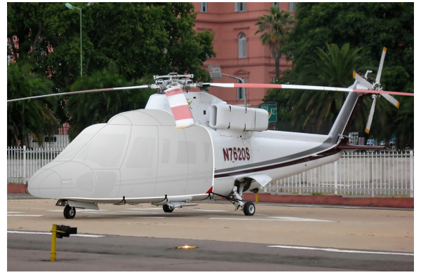
Sikorsky S76 Bubble Cover (Forward Canopy Cover)