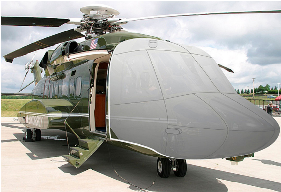
Sikorsky S-92 Windshield/Nose Cover (illustration)

This cover type is made from Silver Acrylic Sunbrella canvas and is 100% lined with a soft and smooth microfiber. Bruce's Custom Covers developed this material combination especially for aircraft protection. The outer material is medium weight and treated for water resistance, UV resistance and anti-static buildup. The inner lining is a very soft and smooth microfiber to prevent scratching. The material is very reflective, and tests show that the cabin interior temperature can be reduced to near-ambient temperature on the hottest of days. It is water, ice and snow repellent, yet breathable to allow moisture to escape from between the cover and the aircraft surface.