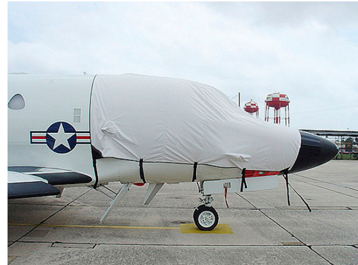
Sabre 40 Cockpit Cover