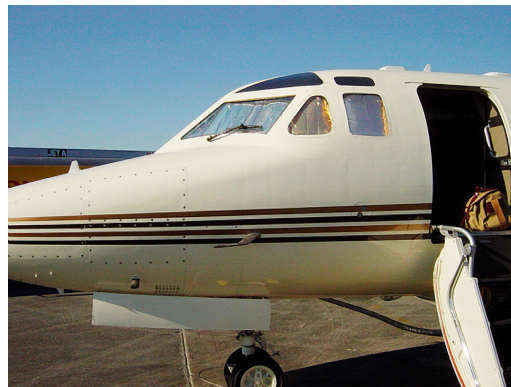
Sabre Cockpit HeatShields Set

Heatshields are interior sunshades for an aircraft's windows or canopy glass. The product is a unique composite of closed-cell foam with a silver mylar finish. The semi-rigid design is stiff enough to stand along the inside of the windshield using sun visors or window framing. It folds up flat and easily stores in the included storage sleeve. Some designs may require velcro and suction cups. A Heatshield is an excellent short-term remedy for cockpit overheating.