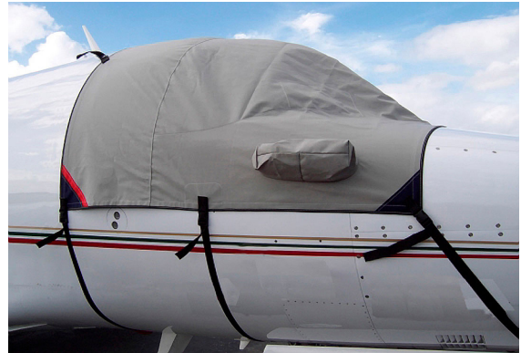
Sabre Cockpit Cover