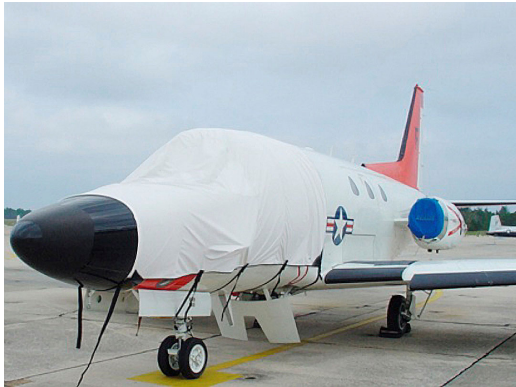
Sabre 40 Cockpit and Engine Covers set

This cover type is made from Silver Acrylic Sunbrella canvas and is 100% lined with a soft and smooth microfiber. Bruce's Custom Covers developed this material combination especially for aircraft protection. The outer material is medium weight and treated for water resistance, UV resistance and anti-static buildup. The inner lining is a very soft and smooth microfiber to prevent scratching. The material is very reflective, and tests show that the cabin interior temperature can be reduced to near-ambient temperature on the hottest of days. It is water, ice and snow repellent, yet breathable to allow moisture to escape from between the cover and the aircraft surface.