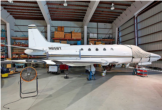
Sabre 40 Cockpit Cover

This cover type is made from Silver Acrylic Sunbrella canvas and is 100% lined with a soft and smooth microfiber. Bruce's Custom Covers developed this material combination especially for aircraft protection. The outer material is medium weight and treated for water resistance, UV resistance and anti-static buildup. The inner lining is a very soft and smooth microfiber to prevent scratching. The material is very reflective, and tests show that the cabin interior temperature can be reduced to near-ambient temperature on the hottest of days. It is water, ice and snow repellent, yet breathable to allow moisture to escape from between the cover and the aircraft surface.