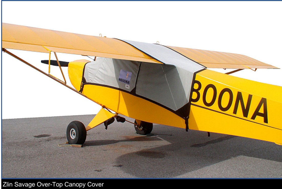
Zlin Savage Over-Top Canopy Cover