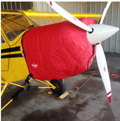
Zlin Savage Insulated Engine Cover