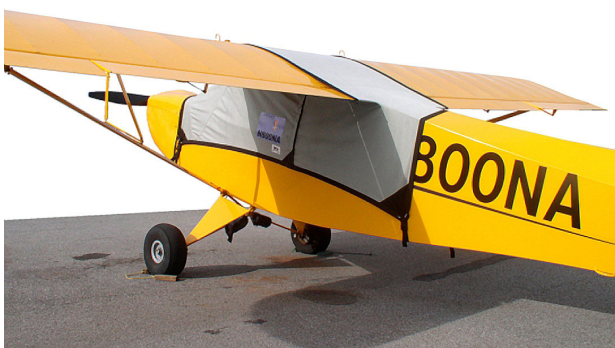
Zlin Savage Over-Top Canopy Cover