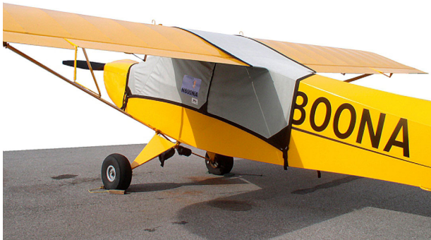
Zlin Savage Over-Top Canopy Cover

This cover type is made from Silver Acrylic Sunbrella canvas and is 100% lined with a soft and smooth microfiber. Bruce's Custom Covers developed this material combination especially for aircraft protection. The outer material is medium weight and treated for water resistance, UV resistance and anti-static buildup. The inner lining is a very soft and smooth microfiber to prevent scratching. The material is very reflective, and tests show that the cabin interior temperature can be reduced to near-ambient temperature on the hottest of days. It is water, ice and snow repellent, yet breathable to allow moisture to escape from between the cover and the aircraft surface.