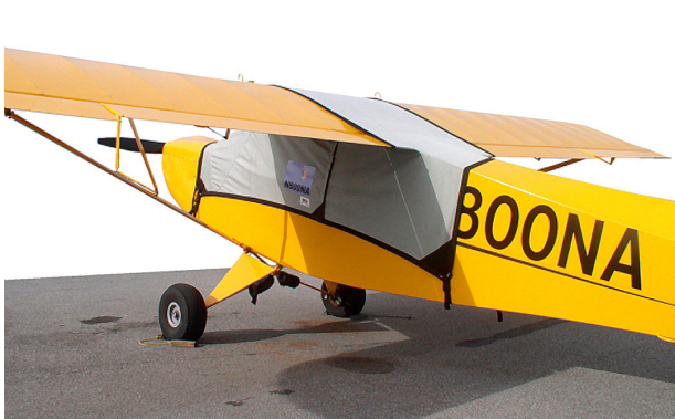
Zlin Savage Over-Top Canopy Cover

This cover type is made from Silver Acrylic Sunbrella canvas and is 100% lined with a soft and smooth microfiber. Bruce's Custom Covers developed this material combination especially for aircraft protection. The outer material is medium weight and treated for water resistance, UV resistance and anti-static buildup. The inner lining is a very soft and smooth microfiber to prevent scratching. The material is very reflective, and tests show that the cabin interior temperature can be reduced to near-ambient temperature on the hottest of days. It is water, ice and snow repellent, yet breathable to allow moisture to escape from between the cover and the aircraft surface.