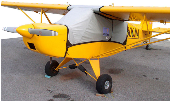
Zlin Savage Canopy Cover

This cover type is made from Silver Acrylic Sunbrella canvas and is 100% lined with a soft and smooth microfiber. Bruce's Custom Covers developed this material combination especially for aircraft protection. The outer material is medium weight and treated for water resistance, UV resistance and anti-static buildup. The inner lining is a very soft and smooth microfiber to prevent scratching. The material is very reflective, and tests show that the cabin interior temperature can be reduced to near-ambient temperature on the hottest of days. It is water, ice and snow repellent, yet breathable to allow moisture to escape from between the cover and the aircraft surface.