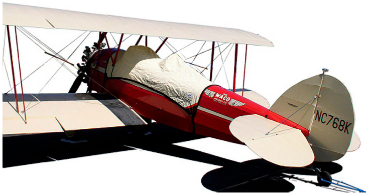
Waco 10 Canopy Cover