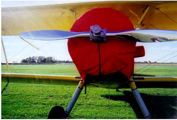
Stearman Engine Cover

the hottest of days. It is water, ice and snow repellent, yet breathable to allow moisture to escape from between the cover and the aircraft surface.