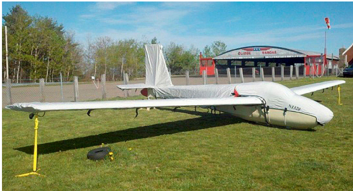
Schweizer 1-26B Canopy/Nose, Empennage & Wing Covers