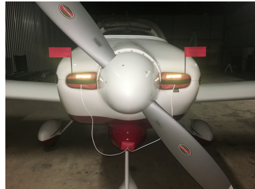
Van's Aircraft RV-7A Engine Inlet Plugs