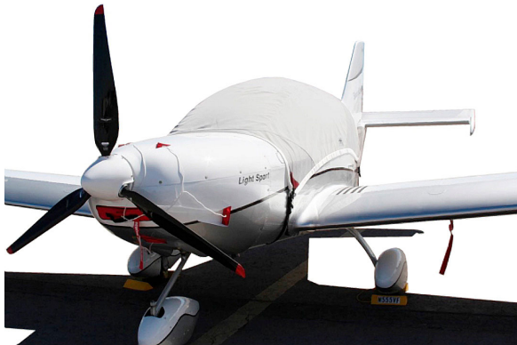
Sportcruiser Canopy Cover & Plugs

Engine Inlet Plugs are custom fit for your Tomark Aero Viper SD4 intakes, made with heavy-duty vinyl material, and stuffed with a single block of sculpted urethane foam. Each plug has a zipper that allows the foam to be removed and dried if necessary. Engine plugs have warning flags that are visible from the cockpit or 'remove before flight' streamers sewn onto the face of the plugs. Most plugs are imprinted with the aircraft registration number in black for an extra charge. Storage bag NOT included. Engine plugs may be inserted after flight when the engine is still warm. Engine Inlet Plugs are commonly referred to as Cowl Plugs, Intake Plugs, Cowl Blocks, Engine Blocks, and Engine Bungs.