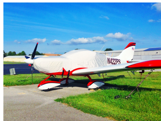
SportCruiser Canopy/Engine Cover