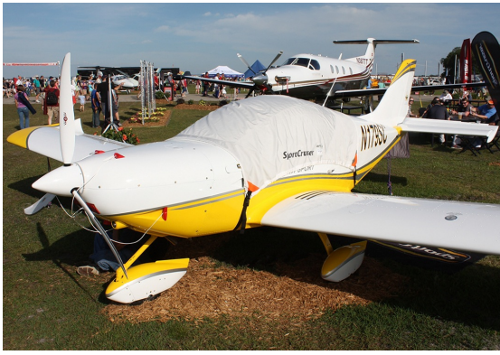
PiperSport Canopy Cover, Engine Plugs