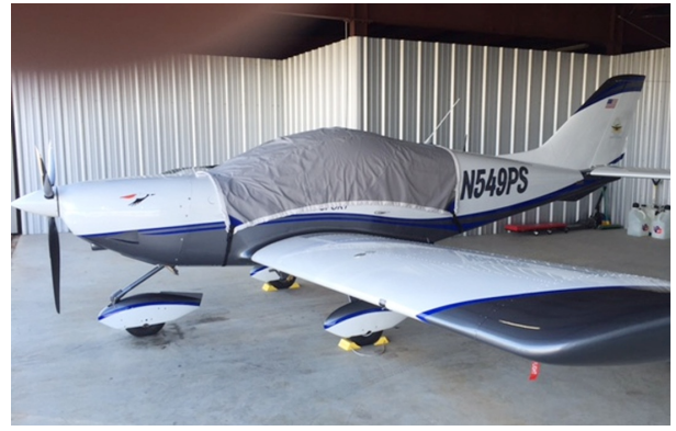
PiperSport Light Weight Travel Cover