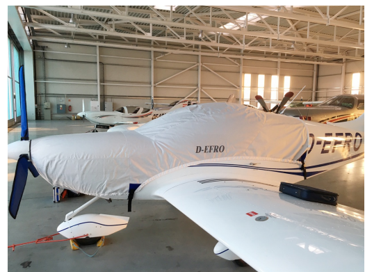
SportCruiser Canopy/Engine Cover