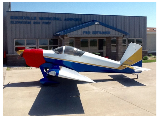
Van's RV-7 Insulated Engine Cover