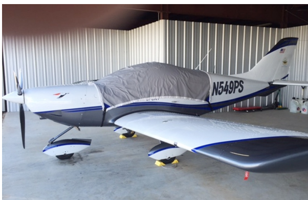
PiperSport Light Weight Travel Cover

This cover type is made from Silver Acrylic Sunbrella canvas and is 100% lined with a soft and smooth microfiber. Bruce's Custom Covers developed this material combination especially for aircraft protection. The outer material is medium weight and treated for water resistance, UV resistance and anti-static buildup. The inner lining is a very soft and smooth microfiber to prevent scratching. The material is very reflective, and tests show that the cabin interior temperature can be reduced to near-ambient temperature on the hottest of days. It is water, ice and snow repellent, yet breathable to allow moisture to escape from between the cover and the aircraft surface.