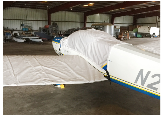
Scheibe Falke SF25 Canopy & Wing Covers