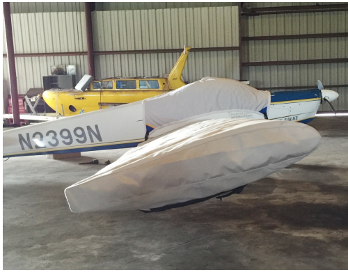
Scheibe Falke SF25 Canopy & Wing Covers