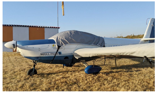
Falke SF-25 C Light Weight Travel Canopy Cover