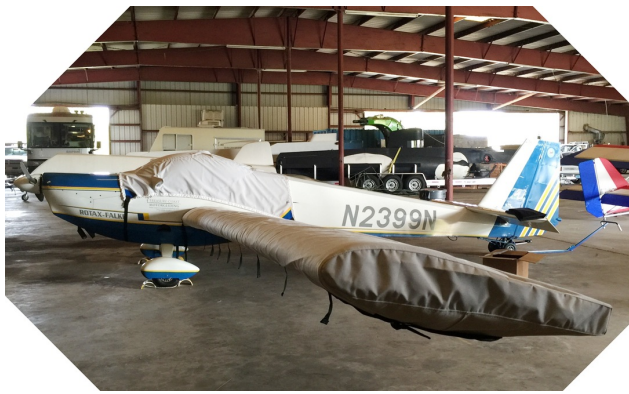
Scheibe Falke SF25 Canopy & Wing Covers