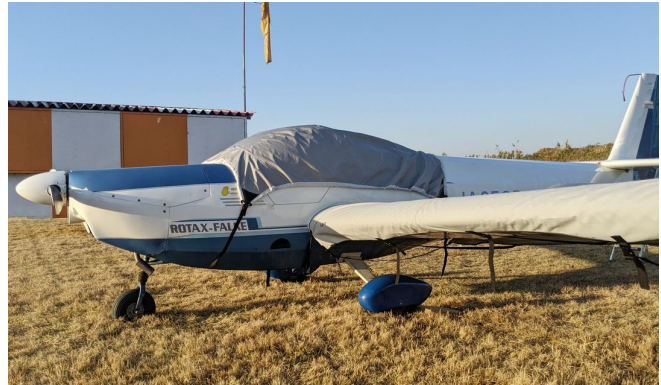
Falke SF-25 C Light Weight Travel Canopy Cover