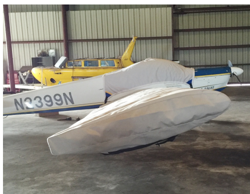
Scheibe Falke SF25 Canopy & Wing Covers