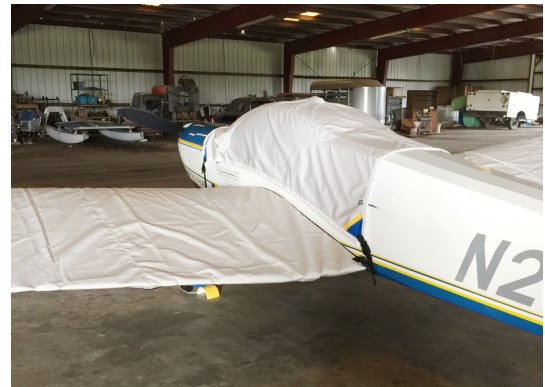
Scheibe Falke SF25 Canopy & Wing Covers