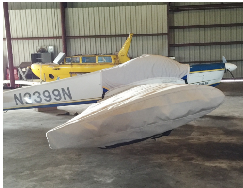
Scheibe Falke SF25 Canopy & Wing Covers