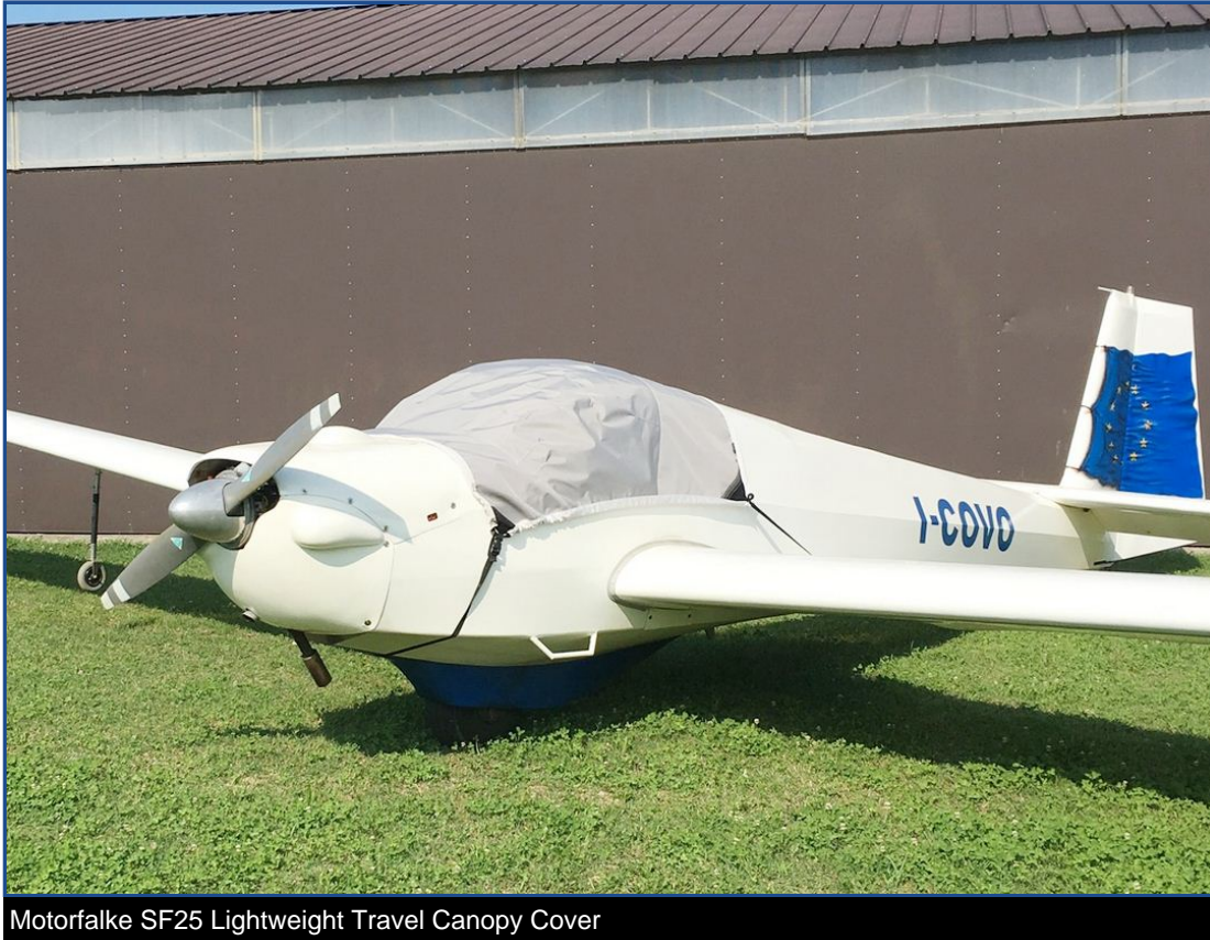
Motorfalke SF25 Lightweight Travel Canopy Cover