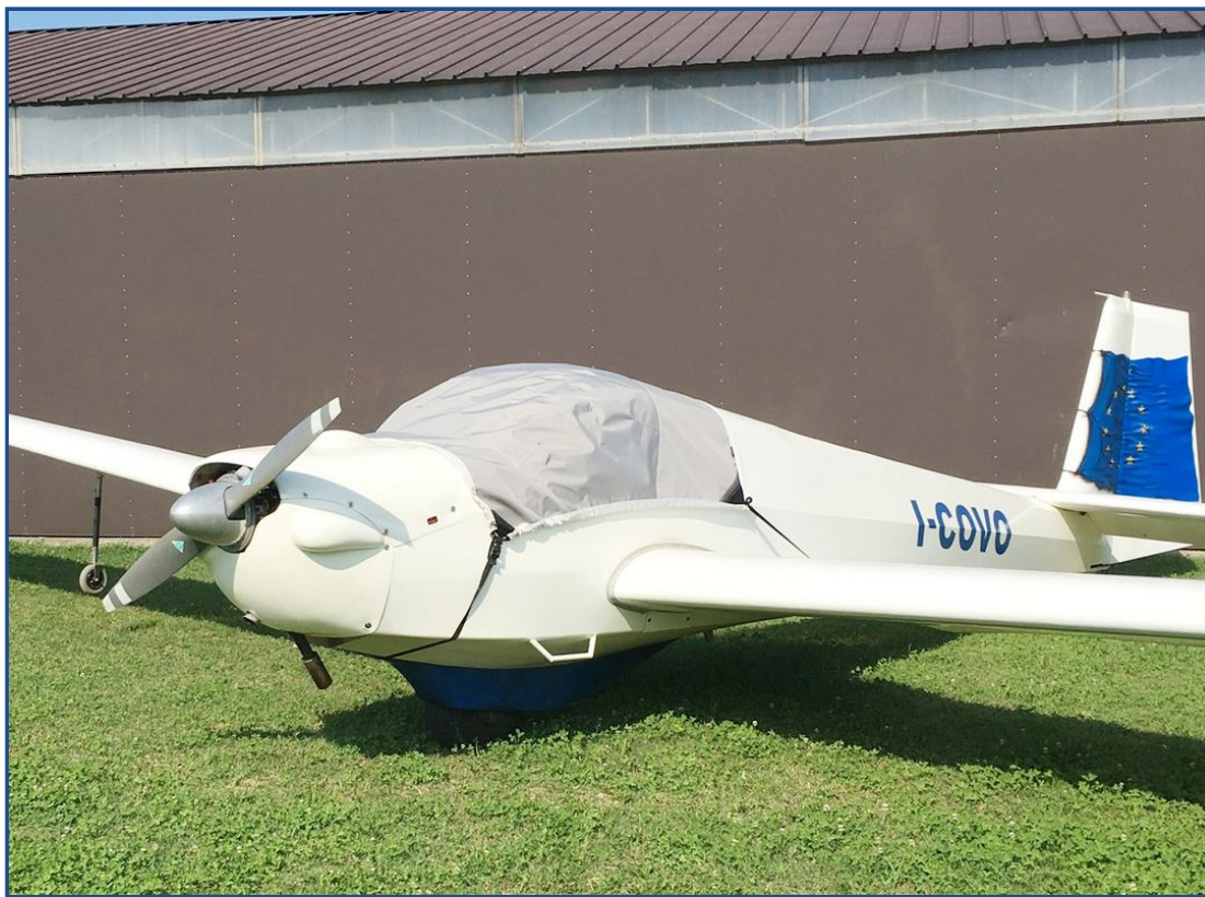
Motorfalke SF25 Lightweight Travel Canopy Cover