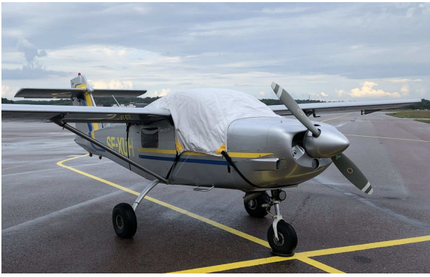
Saab Safari Canopy Cover