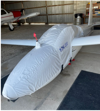
Schweizer 1-26E Canopy/Nose Cover

the hottest of days. It is water, ice and snow repellent, yet breathable to allow moisture to escape from between the cover and the aircraft surface.