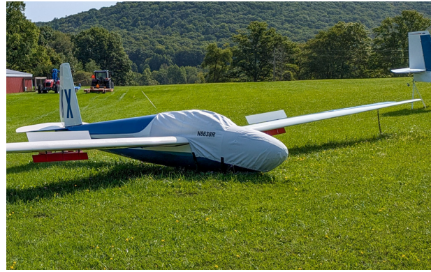
Schweizer 1-23H-15 Canopy/Nose Cover