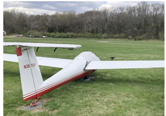
Schweizer 1-36 Canopy & Horiz. Stab. Covers