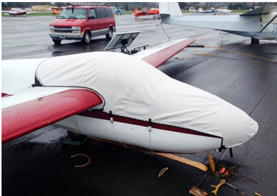
SGS 1-26B Canopy/Nose Cover