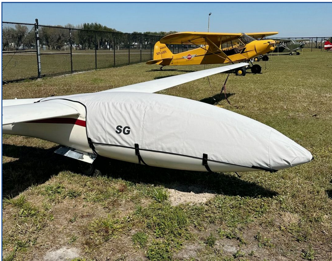
Schreder HP-18 Canopy/Nose Cover