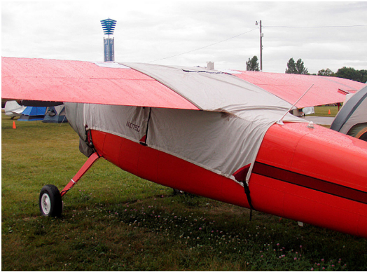
Over-Top Canopy Cover & Engine Cover

The material is very reflective, and tests show that the cabin interior temperature can be reduced to near-ambient temperature on the hottest of days. It is water, ice and snow repellent, yet breathable to allow moisture to escape from between the cover and the aircraft surface.