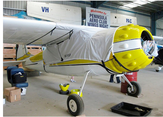
Cessna 195 Canopy Cover, over-top, 24" fwd ext to cover cowl ring gap, gas cap ext.