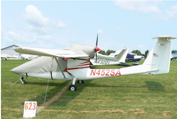
Sky Arrow Canopy & Engine Covers

This cover type is made from Silver Acrylic Sunbrella canvas and is 100% lined with a soft and smooth microfiber. Bruce's Custom Covers developed this material combination especially for aircraft protection. The outer material is medium weight and treated for water resistance, UV resistance and anti-static buildup. The inner lining is a very soft and smooth microfiber to prevent scratching. The material is very reflective, and tests show that the cabin interior temperature can be reduced to near-ambient temperature on the hottest of days. It is water, ice and snow repellent, yet breathable to allow moisture to escape from between the cover and the aircraft surface.