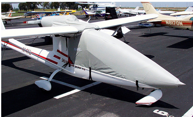
Sky Arrow Canopy & Engine Covers

This cover type is made from Silver Acrylic Sunbrella canvas and is 100% lined with a soft and smooth microfiber. Bruce's Custom Covers developed this material combination especially for aircraft protection. The outer material is medium weight and treated for water resistance, UV resistance and anti-static buildup. The inner lining is a very soft and smooth microfiber to prevent scratching. The material is very reflective, and tests show that the cabin interior temperature can be reduced to near-ambient temperature on the hottest of days. It is water, ice and snow repellent, yet breathable to allow moisture to escape from between the cover and the aircraft surface.