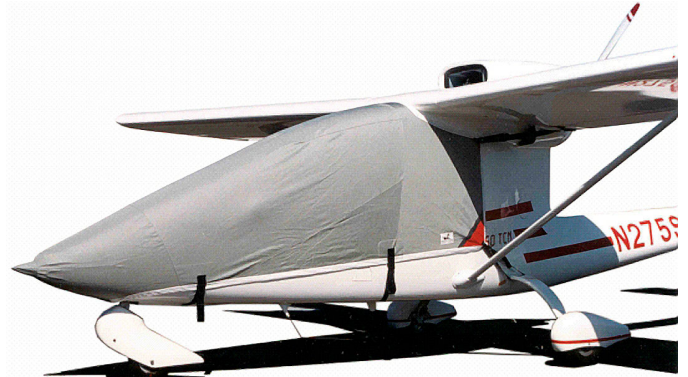
Sky Arrow Standard Canopy Cover