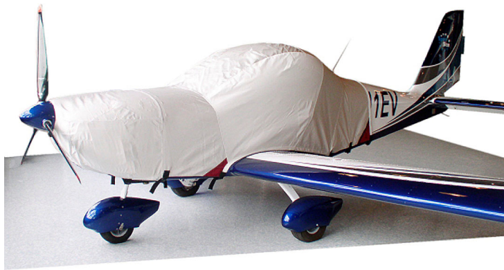
Evezor Sportstar Extended Canopy/Engine Cover

This cover type is made from Silver Acrylic Sunbrella canvas and is 100% lined with a soft and smooth microfiber. Bruce's Custom Covers developed this material combination especially for aircraft protection. The outer material is medium weight and treated for water resistance, UV resistance and anti-static buildup. The inner lining is a very soft and smooth microfiber to prevent scratching. The material is very reflective, and tests show that the cabin interior temperature can be reduced to near-ambient temperature on the hottest of days. It is water, ice and snow repellent, yet breathable to allow moisture to escape from between the cover and the aircraft surface.