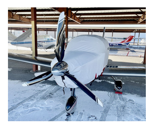
Airplane Factory Sling TSI Extended Canopy/Engine Cover