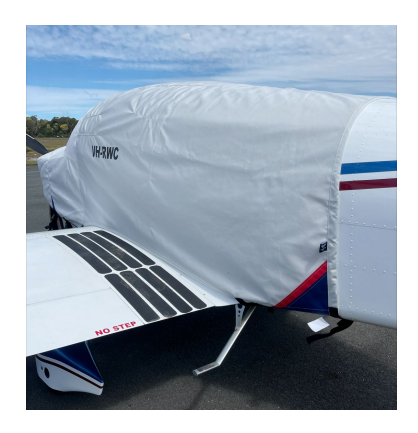
Sling 4 TSi Extended Canopy/Engine Cover

This cover type is made from Silver Acrylic Sunbrella canvas and is 100% lined with a soft and smooth microfiber. Bruce's Custom Covers developed this material combination especially for aircraft protection. The outer material is medium weight and treated for water resistance, UV resistance and anti-static buildup. The inner lining is a very soft and smooth microfiber to prevent scratching. The material is very reflective, and tests show that the cabin interior temperature can be reduced to near-ambient temperature on the hottest of days. It is water, ice and snow repellent, yet breathable to allow moisture to escape from between the cover and the aircraft surface.