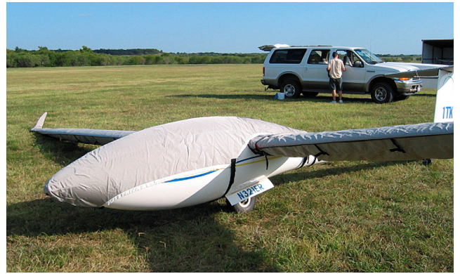
Canopy/Nose Cover, Wings and Horizontal Stab Covers