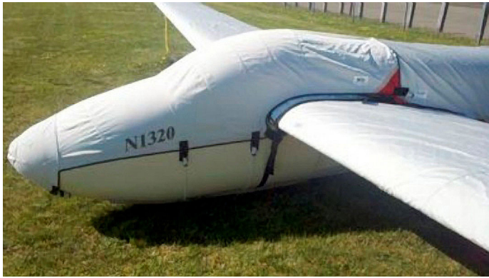
Schweizer SGS 1-26B Canopy/Nose, Wings & Empennage Covers