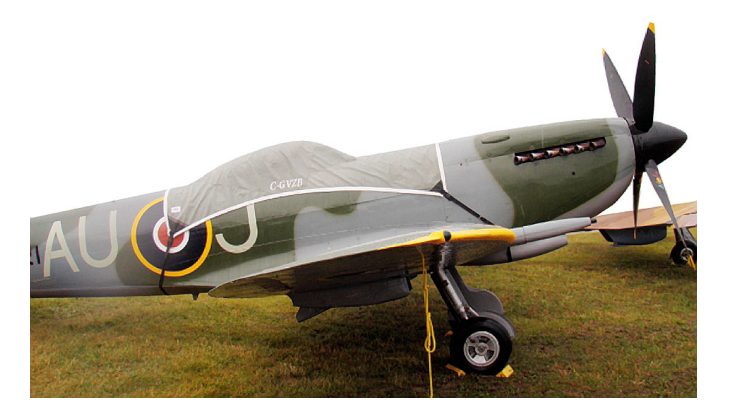
Supermarine Spitfire Mark 16 Canopy Cover

Travel Covers are made with Silver Solution-Dyed Polyester fabric and only lined over the windshield to save weight. The material is lightweight and more compact for easy stowage in the aircraft. The polyester material is water resistant, but only intended for occasional use outside. We also have an ultra lightweight material available for fitted hangar dust covers. For daily outdoor use, the non-travel Sunbrella Cover is the best choice.