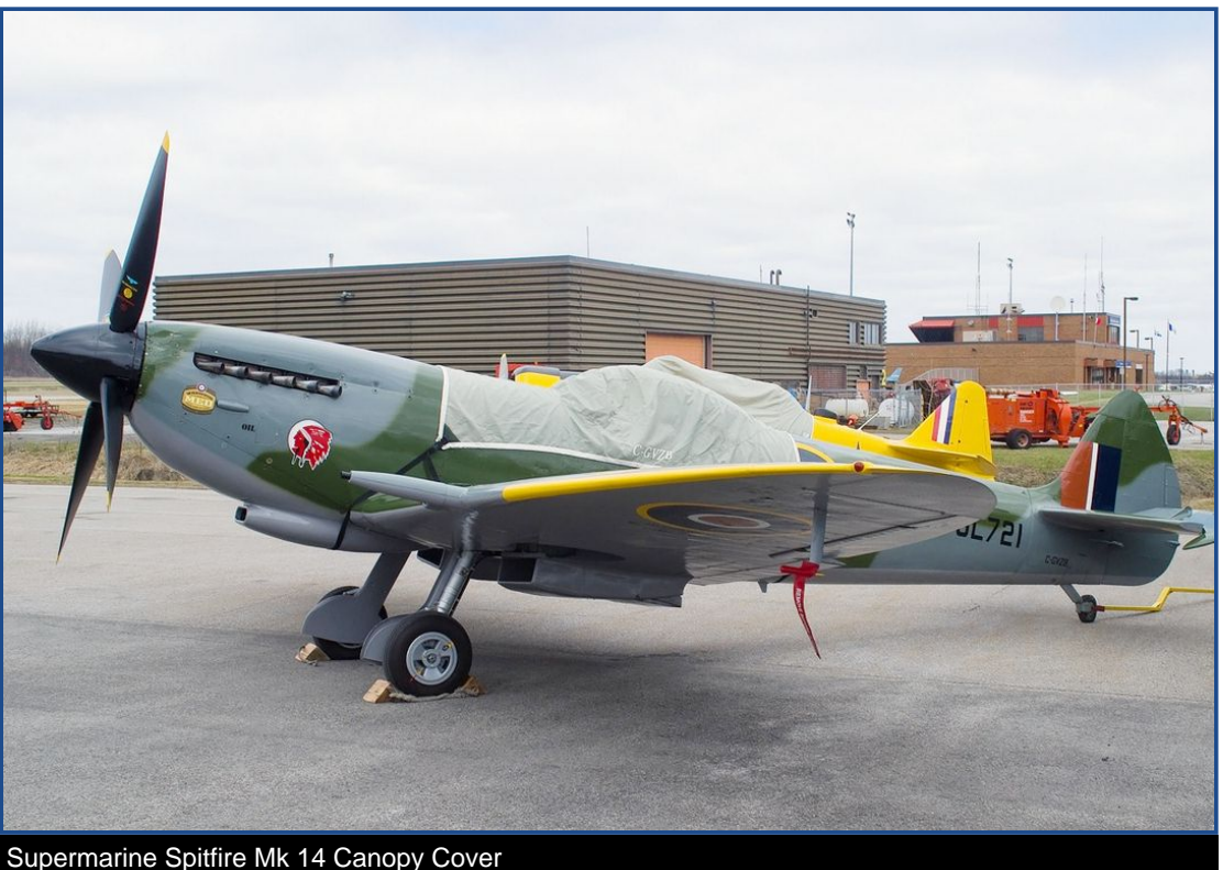
Supermanne Spillire Mk 14 Canopy Cover