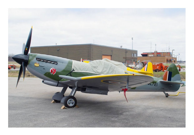
Supermarine Spitfire Mk 14 Canopy Cover