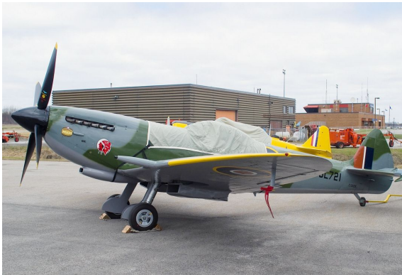
Supermarine Spitfire Mk 14 Canopy Cover

Travel Covers are made with Silver Solution-Dyed Polyester fabric and only lined over the windshield to save weight. The material is lightweight and more compact for easy stowage in the aircraft. The polyester material is water resistant, but only intended for occasional use outside. We also have an ultra lightweight material available for fitted hangar dust covers. For daily outdoor use, the non-travel Sunbrella Cover is the best choice.