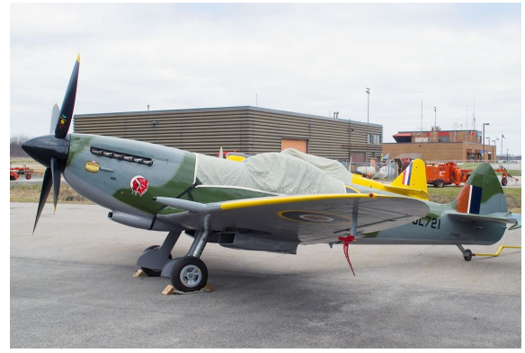
Supermarine Spitfire Mk 14 Canopy Cover