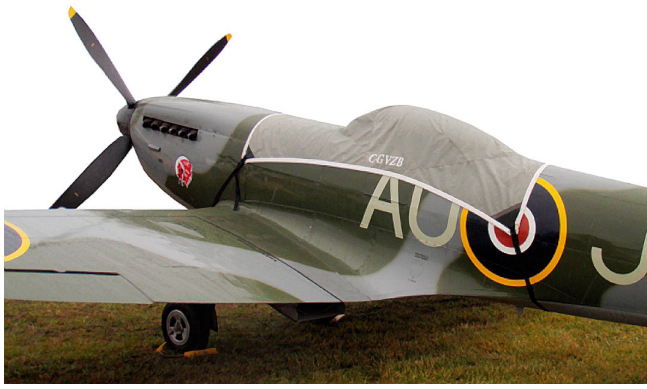
Supermarine Spitfire Mark 16 Canopy Cover