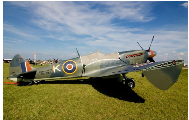
Supermarine Spitfire Mk IX Canopy Cover