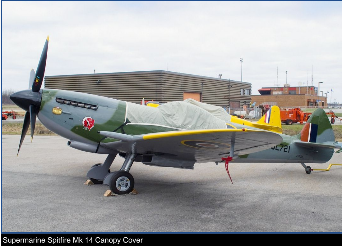
Supermarine Spitfire Mk 14 Canopy Cover