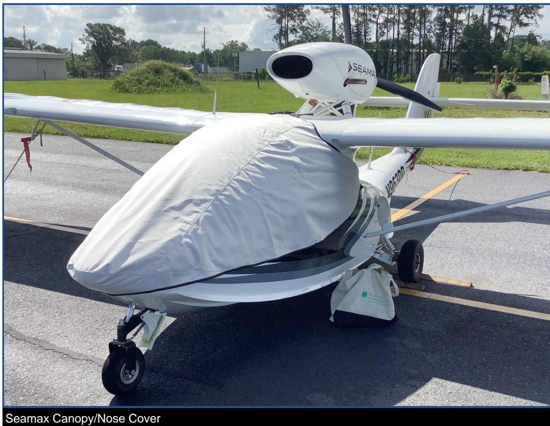
Seamax Canopy/Nose Cover