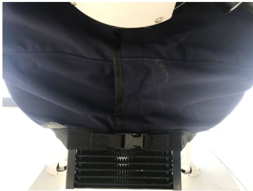
Seamax M22 Engine Cover

Engine Covers will cinch around or behind the spinner, cover the entire engine cowl area including the engine air cooling and induction air inlets, and fastens together with Velcro beneath the spinner down the front of the cowling. The Engine Cover is attached with a belly strap aft of the firewall, and can Velcro to the Canopy Cover. Engine Covers are normally made from Solution-Dyed Polyester or Acrylic Sunbrella . An Insulated version of the engine cover can be made with a thicker, quilted, and water-repellent material. The Insulated Engine Cover works well in cold climates to help with engine preheating.