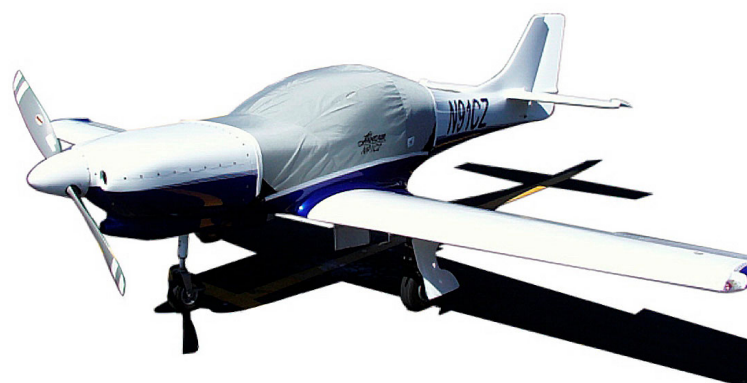
Canopy Cover for Lancair 320/360

This cover type is made from Silver Acrylic Sunbrella canvas and is 100% lined with a soft and smooth microfiber. Bruce's Custom Covers developed this material combination especially for aircraft protection. The outer material is medium weight and treated for water resistance, UV resistance and anti-static buildup. The inner lining is a very soft and smooth microfiber to prevent scratching. The material is very reflective, and tests show that the cabin interior temperature can be reduced to near-ambient temperature on the hottest of days. It is water, ice and snow repellent, yet breathable to allow moisture to escape from between the cover and the aircraft surface.