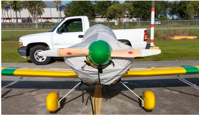
Sonerai Racer Engine Cover

The material is very reflective, and tests show that the cabin interior temperature can be reduced to near-ambient temperature on the hottest of days. It is water, ice and snow repellent, yet breathable to allow moisture to escape from between the cover and the aircraft surface.