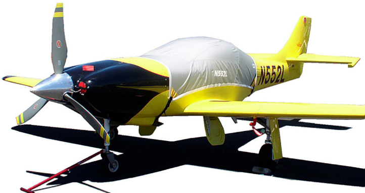
Canopy Cover for Lancair Legacy