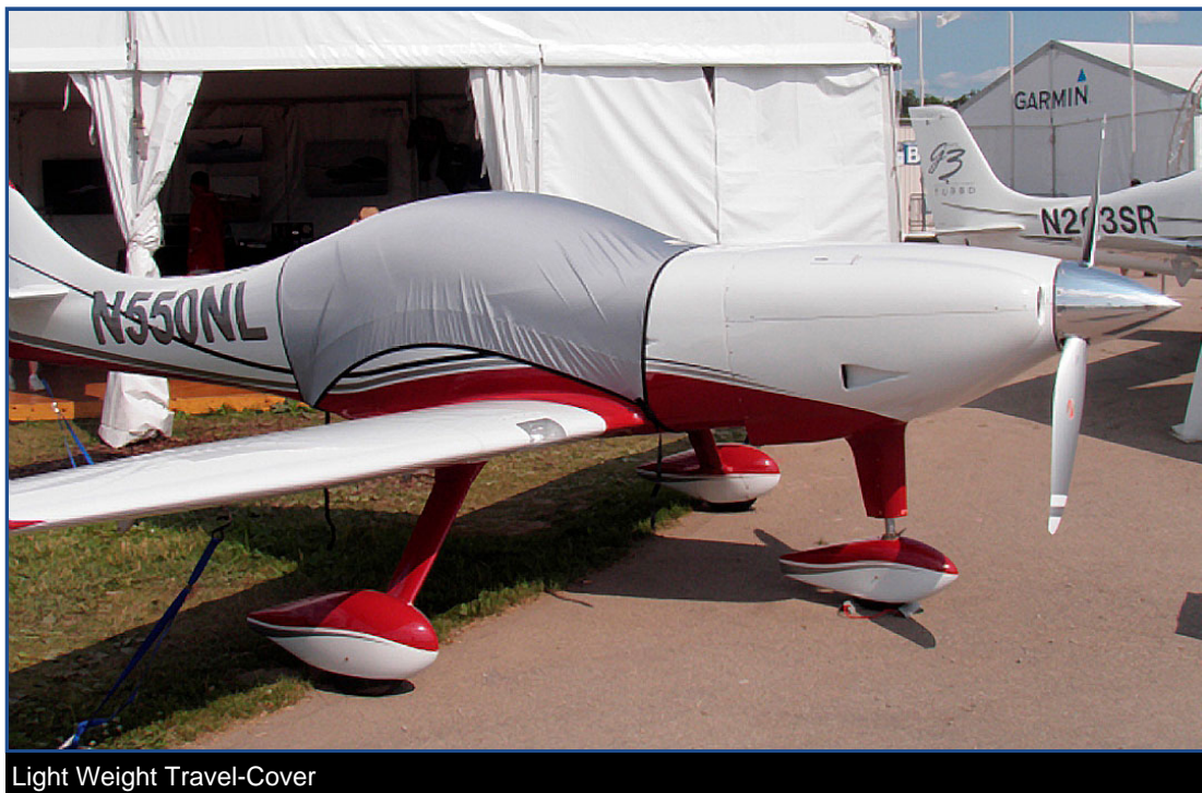
Light Weight Travel-Cover