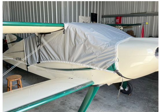
Sorrell SNS-7 Hiperbipe Over The Top Travel Canopy Cover