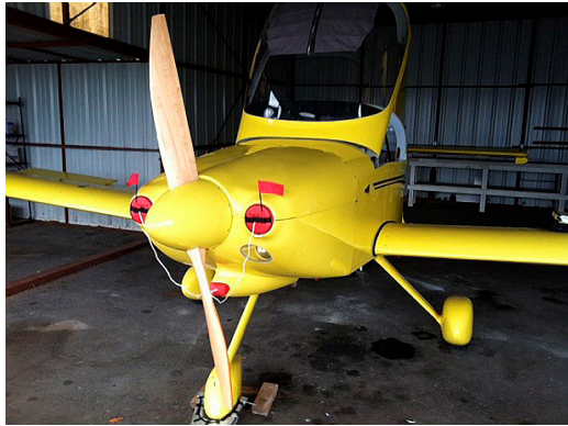
Van's RV-9A Engine Inlet Plugs

Engine Inlet Plugs are custom fit for your Sorrell Hiperbipe SNS-7 intakes, made with heavy-duty vinyl material, and stuffed with a single block of sculpted urethane foam. Each plug has a zipper that allows the foam to be removed and dried if necessary. Engine plugs have warning flags that are visible from the cockpit or 'remove before flight' streamers sewn onto the face of the plugs. Most plugs are imprinted with the aircraft registration number in black for an extra charge. Storage bag NOT included. Engine plugs may be inserted after flight when the engine is still warm. Engine Inlet Plugs are commonly referred to as Cowl Plugs, Intake Plugs, Cowl Blocks, Engine Blocks, and Engine Bungs.