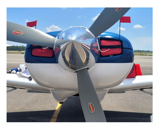
Micco SP20 Engine Inlet Plugs