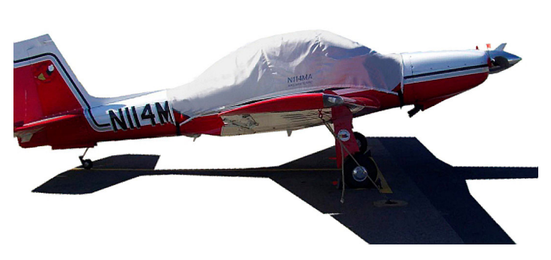
Micco SP20 Canopy Cover & Engine Inlet Plugs

The Micco SP20 Canopy/Engine Cover is a one-piece cover (100% lined with microfiber) that is a combination of the Canopy Cover and Engine Cover. This cover will enclose the engine cowl and will extend aft to cover all of the windows. This cover type is made from Silver Acrylic Sunbrella canvas and is 100% lined with a soft and smooth microfiber. Bruce's Custom Covers developed this material combination especially for aircraft protection. The outer material is medium weight and treated for water resistance, UV resistance and anti-static buildup. The inner lining is a very soft and smooth microfiber to prevent scratching. The material is very reflective, and tests show that the cabin interior temperature can be reduced to near-ambient temperature on the hottest of days. It is water, ice and snow repellent, yet breathable to allow moisture to escape from between the cover and the aircraft surface.