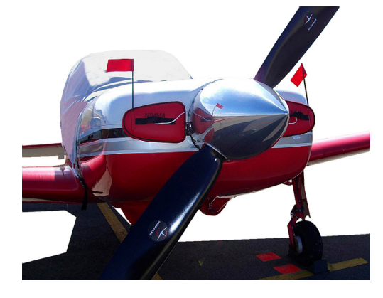
Micco SP20 Canopy Cover & Engine Inlet Plugs