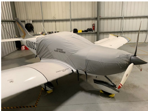
Czech Sport Travel Light Weight Canopy/Engine Cover, Wing Locker Covers

Travel Covers are made with Silver Solution-Dyed Polyester fabric and only lined over the windshield to save weight. The material is lightweight and more compact for easy stowage in the aircraft. The polyester material is water resistant, but only intended for occasional use outside. We also have an ultra lightweight material available for fitted hangar dust covers. For daily outdoor use, the non-travel Sunbrella Cover is the best choice.