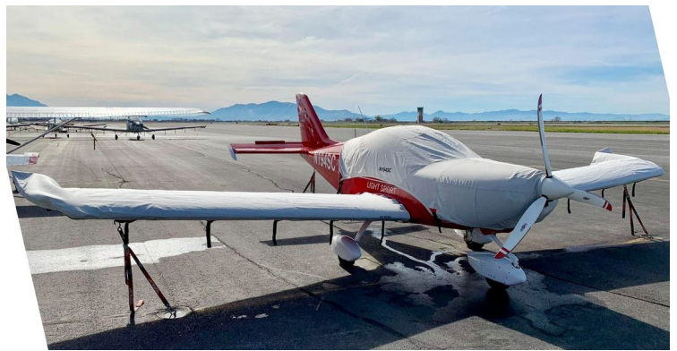
Czech Sport Canopy/Engine & Wing Covers