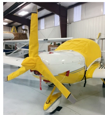
Custom Yellow Canopy Cover, Prop/Spinner, and Inlet Plugs