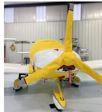
Custom Yellow Canopy Cover, Prop/Spinner, and Inlet Plugs