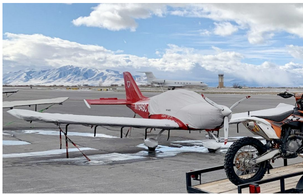
Czech Aircraft SportCruiser Canopy/Engine & Wing Covers