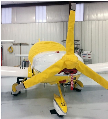
Custom Yellow Canopy Cover, Prop/Spinner, and Inlet Plugs

Engine Inlet Plugs are custom fit for your Czech Aircraft Works SportCruiser intakes, made with heavy-duty vinyl material, and stuffed with a single block of sculpted urethane foam. Each plug has a zipper that allows the foam to be removed and dried if necessary. Engine plugs have warning flags that are visible from the cockpit or 'remove before flight' streamers sewn onto the face of the plugs. Most plugs are imprinted with the aircraft registration number in black for an extra charge. Storage bag NOT included. Engine plugs may be inserted after flight when the engine is still warm. Engine Inlet Plugs are commonly referred to as Cowl Plugs, Intake Plugs, Cowl Blocks, Engine Blocks, and Engine Bungs.