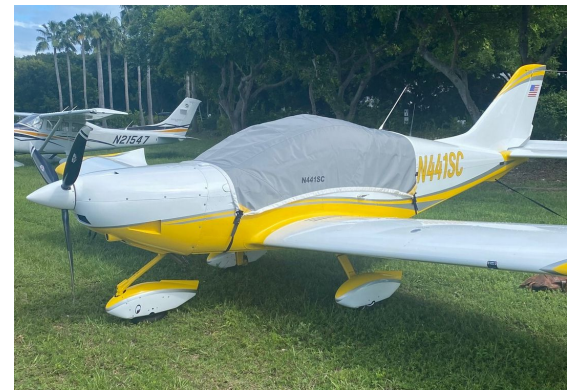
SportCruiser Travel Canopy Cover