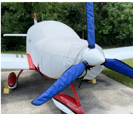
PiperSport Extended Canopy/Engine Cover

This cover type is made from Silver Acrylic Sunbrella canvas and is 100% lined with a soft and smooth microfiber. Bruce's Custom Covers developed this material combination especially for aircraft protection. The outer material is medium weight and treated for water resistance, UV resistance and anti-static buildup. The inner lining is a very soft and smooth microfiber to prevent scratching. The material is very reflective, and tests show that the cabin interior temperature can be reduced to near-ambient temperature on the hottest of days. It is water, ice and snow repellent, yet breathable to allow moisture to escape from between the cover and the aircraft surface.