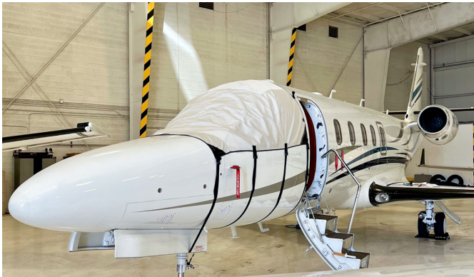
Astron SPX Cockpit Cover

This cover type is made from Silver Acrylic Sunbrella canvas and is 100% lined with a soft and smooth microfiber. Bruce's Custom Covers developed this material combination especially for aircraft protection. The outer material is medium weight and treated for water resistance, UV resistance and anti-static buildup. The inner lining is a very soft and smooth microfiber to prevent scratching. The material is very reflective, and tests show that the cabin interior temperature can be reduced to near-ambient temperature on the hottest of days. It is water, ice and snow repellent, yet breathable to allow moisture to escape from between the cover and the aircraft surface.