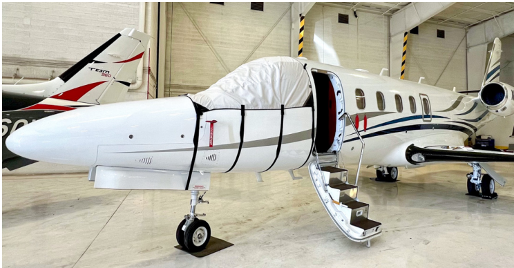
Astron SPX Cockpit Cover