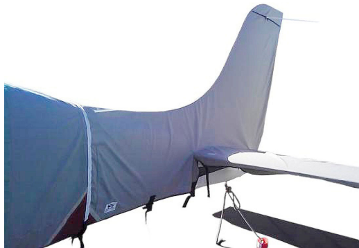
Cirrus SR20 Empennage Cover (covers tail boom, vertical and horizontal stabilizers)

WINTER USE MATERIAL - Made with Solution-Dyed Polyester fabric, this option is intended for seasonal use to aid in deicing, rain mitigation, or for occasional travel. The material is lighter and more compact, but more susceptible to UV damage and may have a shorter useful life if used continuously outside than the all-year use material.