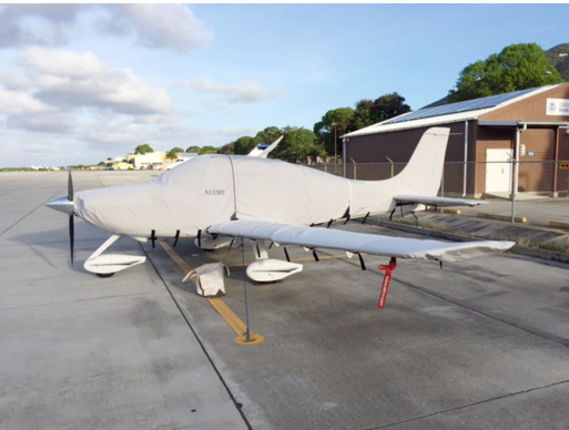
Cirrus SR-22 Full Cover Set