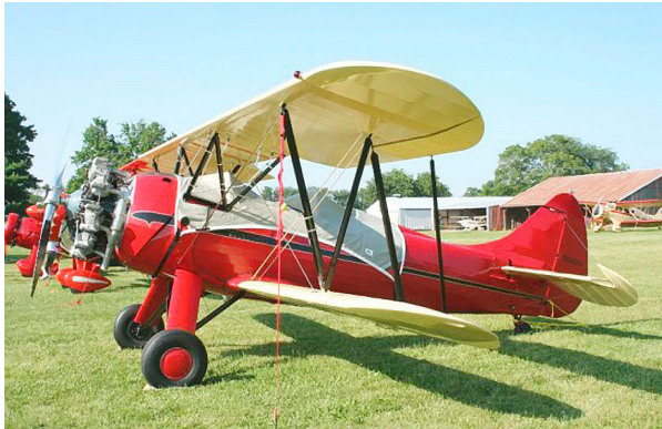
Waco YMF Canopy Cover