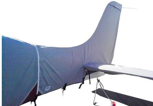
Cirrus SR20 Empennage Cover (covers tail boom, vertical and horizontal stabilizers)