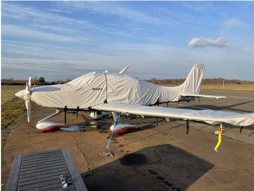
Cirrus SR-22 Complete Cover Set

WINTER USE MATERIAL - Made with Solution-Dyed Polyester fabric, this option is intended for seasonal use to aid in deicing, rain mitigation, or for occasional travel. The material is lighter and more compact, but more susceptible to UV damage and may have a shorter useful life if used continuously outside than the all-year use material.