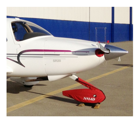
Cirrus SR20 Front Wheelpant/Strut Cover, Engine Plugs