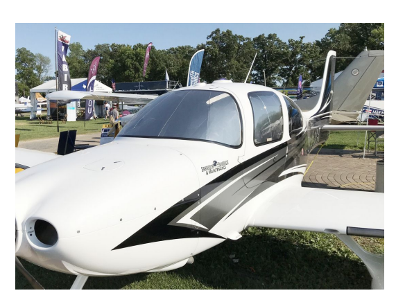
Cirrus SR-22 Cockpit HeatShields