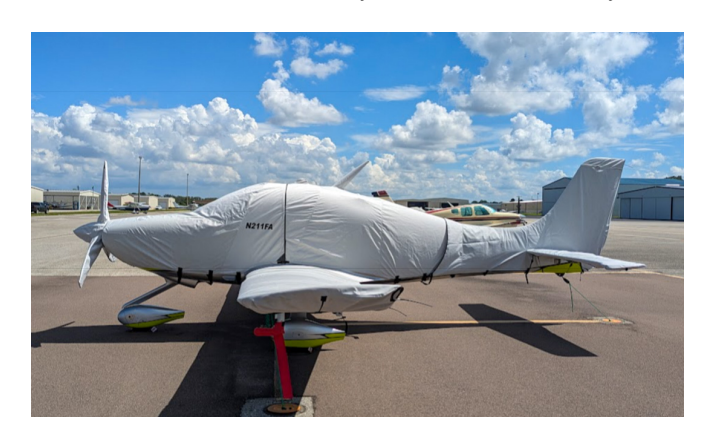
Cirrus SR-20 Complete Cover Set

WINTER USE MATERIAL - Made with Solution-Dyed Polyester fabric, this option is intended for seasonal use to aid in deicing, rain mitigation, or for occasional travel. The material is lighter and more compact, but more susceptible to UV damage and may have a shorter useful life if used continuously outside than the all-year use material.