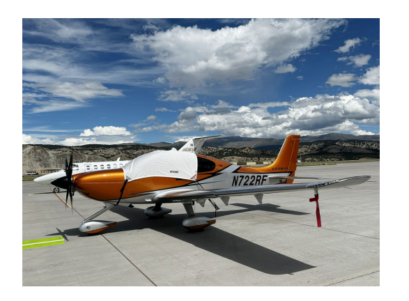
Cirrus SR22 Cockpit Cover, Windshield And Forward Side Windows