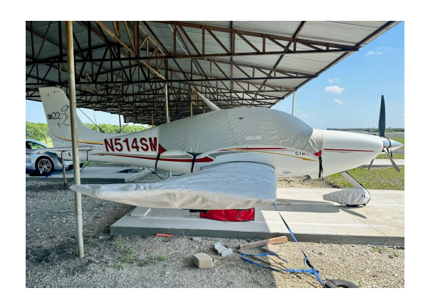
Cirrus SR-22 Canopy, Wing & Wheelpant Covers

Designed to prevent damage to the aircraft extremities in crowded hangars, these products are made of bright red Naugahyde and thickly padded with a sandwich of closed cell foam.