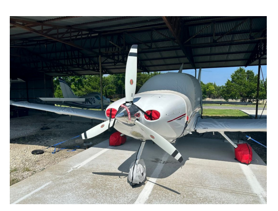
Cirrus SR-22 Wheelpant Covers