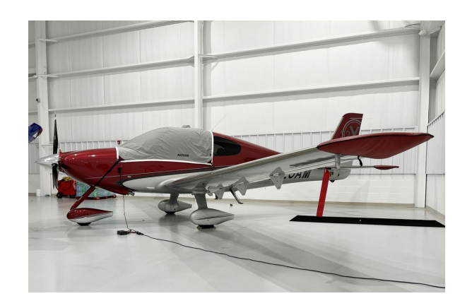
Cirrus SR-22 Cockpit Cover