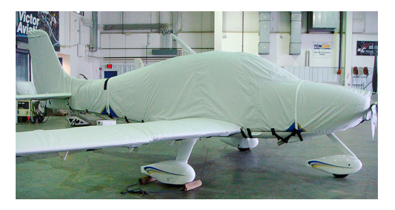
Cirrus SR20 Full Cover Set (Extended Canopy Cover, Engine Cover, Wing Covers, Empennage Cover)