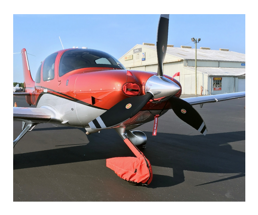
Cirrus SR22 Front Wheelpant/Strut Cover