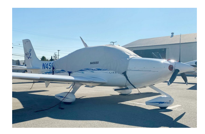
Cirrus SR20 Canopy Cover

This cover type is made from Silver Acrylic Sunbrella canvas and is 100% lined with a soft and smooth microfiber. Bruce's Custom Covers developed this material combination especially for aircraft protection. The outer material is medium weight and treated for water resistance, UV resistance and anti-static buildup. The inner lining is a very soft and smooth microfiber to prevent scratching. The material is very reflective, and tests show that the cabin interior temperature can be reduced to near-ambient temperature on the hottest of days. It is water, ice and snow repellent, yet breathable to allow moisture to escape from between the cover and the aircraft surface.