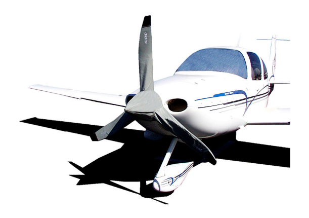
Cirrus SR-22 Propellor/Spinner Cover & Windshield Heatshield

Windshield Heatshields are interior sunshades for an aircraft's front windshield. The product is a unique composite of closed-cell foam with a silver mylar finish. The semi-rigid design is stiff enough to stand along the inside of the windshield using sun visors or window framing. It folds up flat and easily stores in the included storage sleeve. Some designs may require velcro and suction cups or split right and left sides. A Heatshield is an excellent short-term remedy for cockpit overheating. An external fabric cover is far more effective and practical for long-term protection.