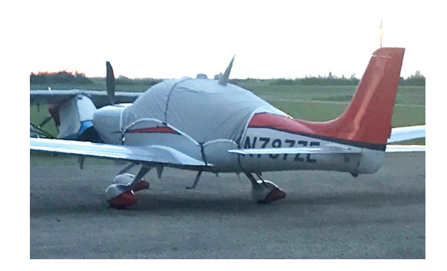
Cirrus SR-22 Canopy Cover, extended to cover parachute panel