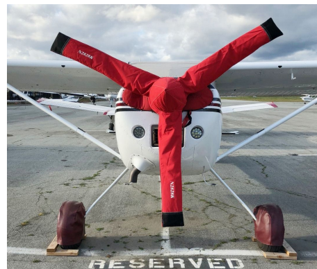
Cessna Skywagon Propellor/Spinner Cover, 3-blade type