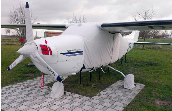
Cessna 210 Extended Canopy Cover, Engine Plugs, Prop and Tire Covers