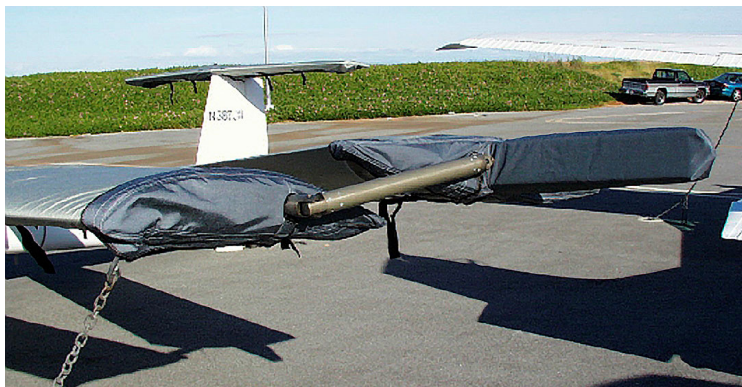
End Cap Covers are used when wing are in folded position.