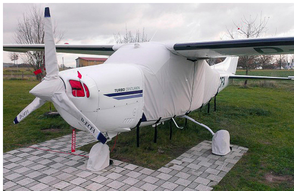
Cessna 210 Extended Canopy Cover, Engine Plugs, Prop and Tire Covers