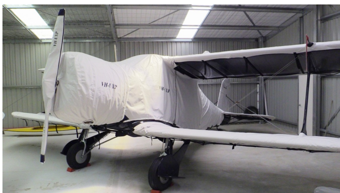
Beech Staggerwing Complete Cover Set

This cover type is made from Silver Acrylic Sunbrella canvas and is 100% lined with a soft and smooth microfiber. Bruce's Custom Covers developed this material combination especially for aircraft protection. The outer material is medium weight and treated for water resistance, UV resistance and anti-static buildup. The inner lining is a very soft and smooth microfiber to prevent scratching. The material is very reflective, and tests show that the cabin interior temperature can be reduced to near-ambient temperature on the hottest of days. It is water, ice and snow repellent, yet breathable to allow moisture to escape from between the cover and the aircraft surface.