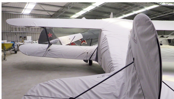
Beech Staggerwing Complete Cover Set

WINTER USE MATERIAL - Made with Solution-Dyed Polyester fabric, this option is intended for seasonal use to aid in deicing, rain mitigation, or for occasional travel. The material is lighter and more compact, but more susceptible to UV damage and may have a shorter useful life if used continuously outside than the all-year use material.