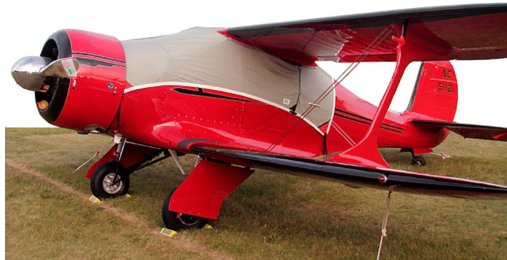
Beech Staggerwing Canopy Cover

Travel Covers are made with Silver Solution-Dyed Polyester fabric and only lined over the windshield to save weight. The material is lightweight and more compact for easy stowage in the aircraft. The polyester material is water resistant, but only intended for occasional use outside. We also have an ultra lightweight material available for fitted hangar dust covers. For daily outdoor use, the non-travel Sunbrella Cover is the best choice.