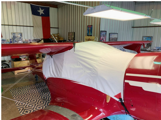
Beech Staggerwing D17S Canopy Cover

This cover type is made from Silver Acrylic Sunbrella canvas and is 100% lined with a soft and smooth microfiber. Bruce's Custom Covers developed this material combination especially for aircraft protection. The outer material is medium weight and treated for water resistance, UV resistance and anti-static buildup. The inner lining is a very soft and smooth microfiber to prevent scratching. The material is very reflective, and tests show that the cabin interior temperature can be reduced to near-ambient temperature on the hottest of days. It is water, ice and snow repellent, yet breathable to allow moisture to escape from between the cover and the aircraft surface.