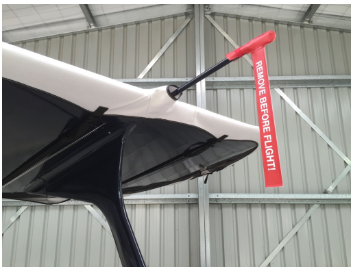
Beech Staggerwing Complete Cover Set, Upper Wing Detail

Engine Inlet Plugs are custom fit for your Beech Staggerwing intakes, made with heavy-duty vinyl material, and stuffed with a single block of sculpted urethane foam. Each plug has a zipper that allows the foam to be removed and dried if necessary. Engine plugs have warning flags that are visible from the cockpit or 'remove before flight' streamers sewn onto the face of the plugs. Most plugs are imprinted with the aircraft registration number in black for an extra charge. Storage bag NOT included. Engine plugs may be inserted after flight when the engine is still warm. Engine Inlet Plugs are commonly referred to as Cowl Plugs, Intake Plugs, Cowl Blocks, Engine Blocks, and Engine Bungs.