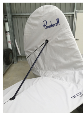
Beech Staggerwing Complete Cover Set, Tail Detail