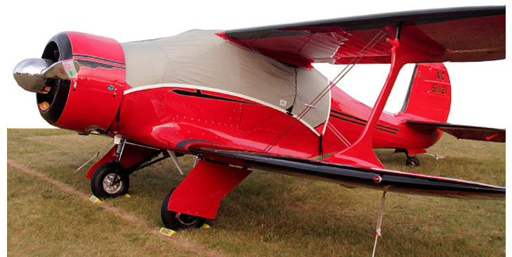
Beech Staggerwing Canopy Cover