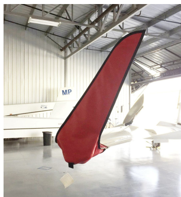
Schleicher ASH Wingtip Pads

Designed to prevent damage to the wingtip in crowded hangars or high traffic areas, these products are made of bright red Naugahyde and thickly padded with a sandwich of closed cell foam. Protects delicate winglets, casters and their housings, and soft finishes.