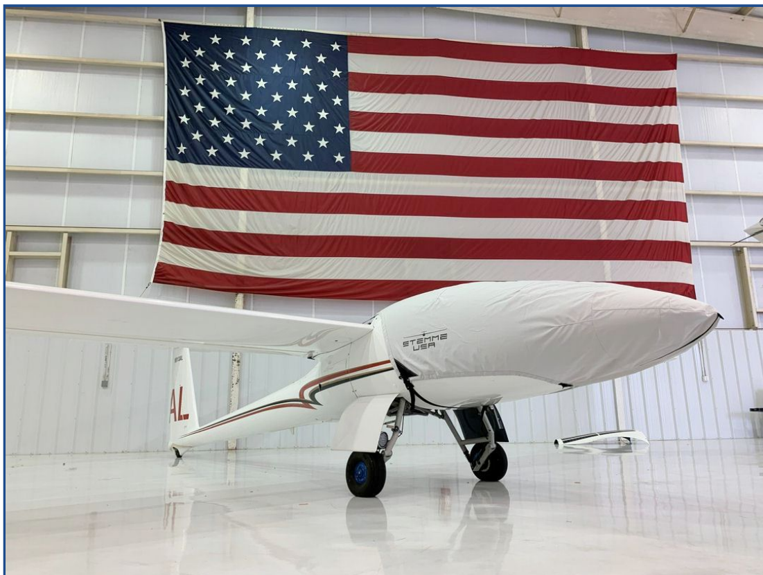
Stemme S-12 Canopy/Nose Cover