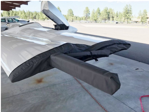
Stemme S-10 Wing Fold Covers

WINTER USE MATERIAL - Made with Solution-Dyed Polyester fabric, this option is intended for seasonal use to aid in deicing, rain mitigation, or for occasional travel. The material is lighter and more compact, but more susceptible to UV damage and may have a shorter useful life if used continuously outside than the all-year use material.