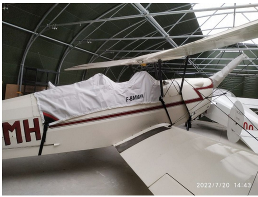
Stampe SV-4 Canopy Cover