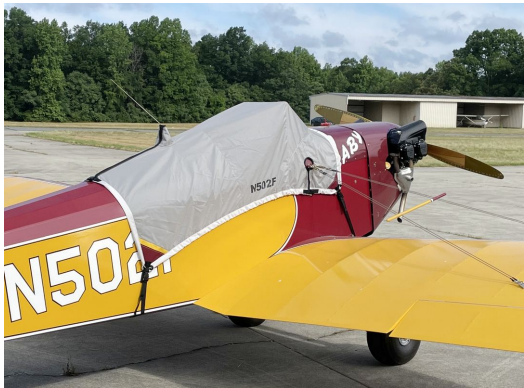
Bowers Fly Baby Canopy Cover