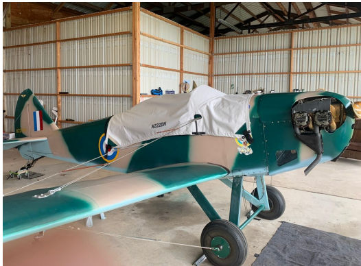
Bowers Fly Baby Canopy Cover