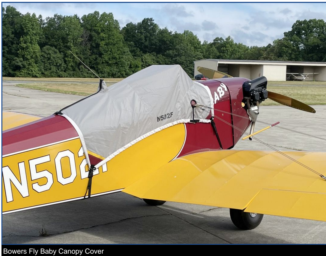
Bowers Fly Baby Canopy Cover