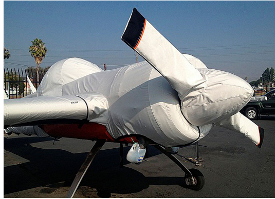
Sukhoi SU-26 Extended Canopy/Engine Cover Yak 55 Full Fuselage Cover w/ Detachable Wing Covers & Propellor/Spinner Cover