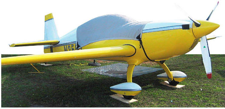
Extra 300/L Canopy Cover