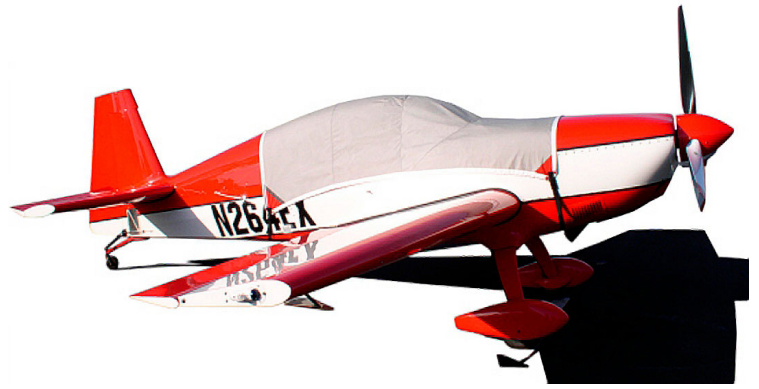
Canopy Cover for the Extra 300