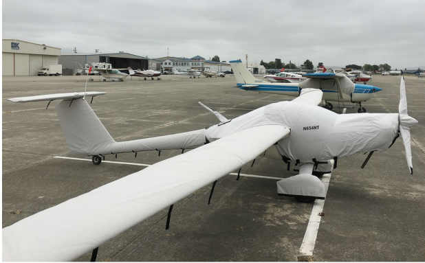
Distar Sundancer LSA Extended Canopy/Engine, Prop, Wheel pants, Wings & Empennage Covers