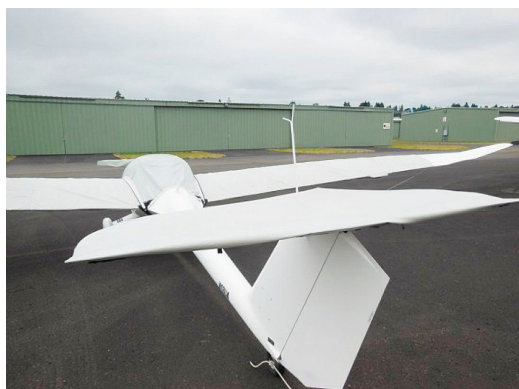
Lambada Canopy/Engine, Wing & Horiz. Stab. Covers