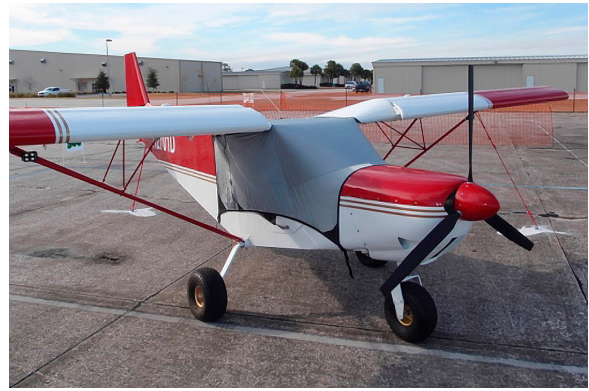
Zenith 701 Spandex FlyAway Travel Canopy Cover