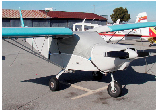
Zenith 801 Standard Canopy Cover

This cover type is made from Silver Acrylic Sunbrella canvas and is 100% lined with a soft and smooth microfiber. Bruce's Custom Covers developed this material combination especially for aircraft protection. The outer material is medium weight and treated for water resistance, UV resistance and anti-static buildup. The inner lining is a very soft and smooth microfiber to prevent scratching. The material is very reflective, and tests show that the cabin interior temperature can be reduced to near-ambient temperature on the hottest of days. It is water, ice and snow repellent, yet breathable to allow moisture to escape from between the cover and the aircraft surface.