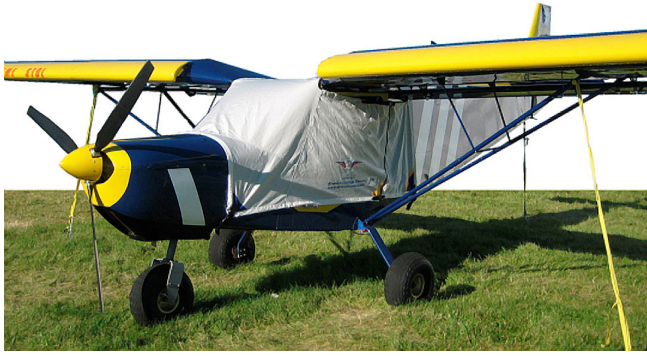
Zenith 701 Standard Canopy Cover