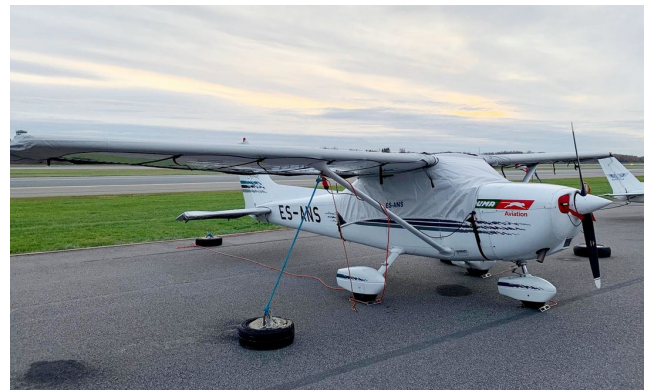
Cessna 172R Canopy Cover Wrap Around