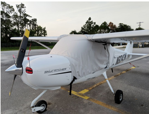
Cessna Skycatcher 162 Canopy Cover and Engine Inlet Plugs

Engine Inlet Plugs are custom fit for your Savannah VG & S Models intakes, made with heavy-duty vinyl material, and stuffed with a single block of sculpted urethane foam. Each plug has a zipper that allows the foam to be removed and dried if necessary. Engine plugs have warning flags that are visible from the cockpit or 'remove before flight' streamers sewn onto the face of the plugs. Most plugs are imprinted with the aircraft registration number in black for an extra charge. Storage bag NOT included. Engine plugs may be inserted after flight when the engine is still warm. Engine Inlet Plugs are commonly referred to as Cowl Plugs, Intake Plugs, Cowl Blocks, Engine Blocks, and Engine Bungs.