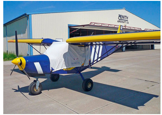
Zenith 701 Standard Canopy Cover