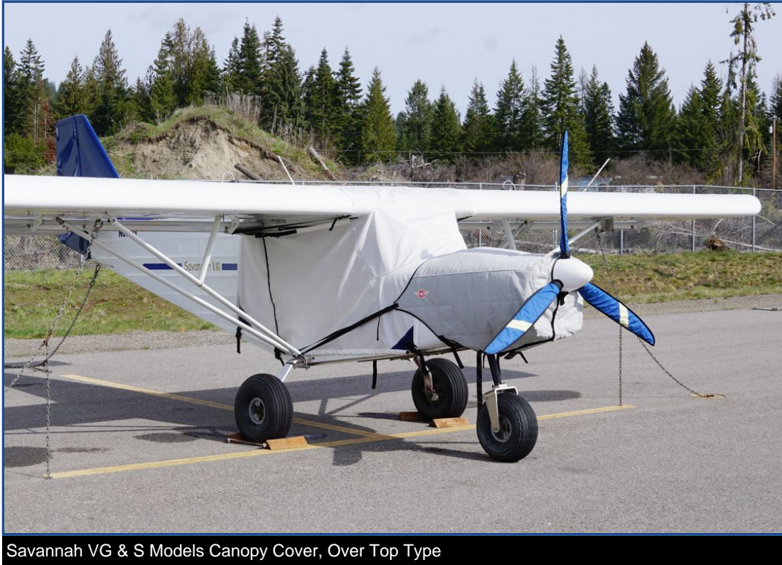
Savannah VG &amp; S Models Canopy Cover, Over Top Type