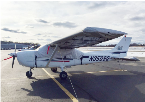
Cessna 172 Engine, Wings and Empennage Covers Cessna 172 Engine Plugs and Canopy, Wing, Horizontal Stabilizer Covers