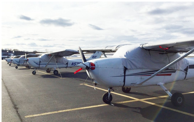
Cessna 172 Engine Plugs and Canopy, Wing, Horizontal Stabilizer Covers

WINTER USE MATERIAL - Made with Solution-Dyed Polyester fabric, this option is intended for seasonal use to aid in deicing, rain mitigation, or for occasional travel. The material is lighter and more compact, but more susceptible to UV damage and may have a shorter useful life if used continuously outside than the all-year use material.