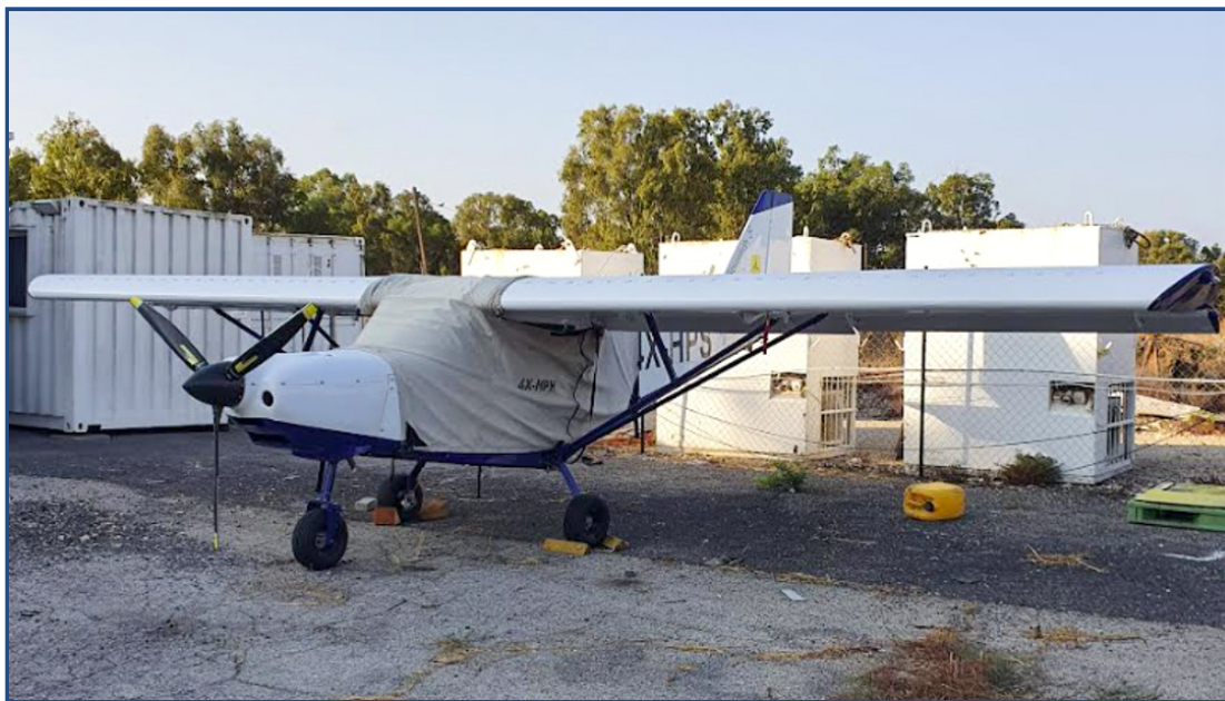
Savannah VG Canopy Cover, Over-Top Type