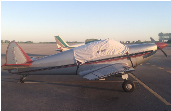
Globe Swift Canopy Cover