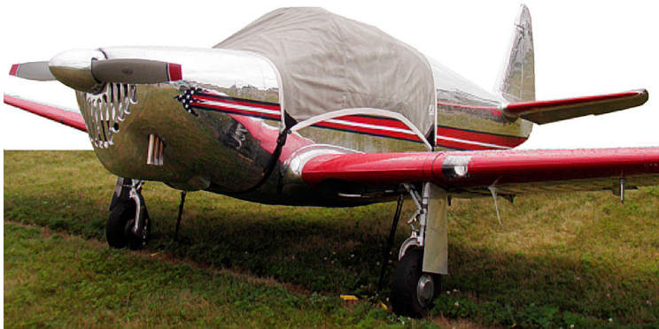
Swift Canopy Cover

This cover type is made from Silver Acrylic Sunbrella canvas and is 100% lined with a soft and smooth microfiber. Bruce's Custom Covers developed this material combination especially for aircraft protection. The outer material is medium weight and treated for water resistance, UV resistance and anti-static buildup. The inner lining is a very soft and smooth microfiber to prevent scratching. The material is very reflective, and tests show that the cabin interior temperature can be reduced to near-ambient temperature on the hottest of days. It is water, ice and snow repellent, yet breathable to allow moisture to escape from between the cover and the aircraft surface.