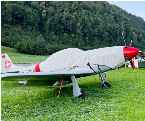
Stewart S-51 Canopy & Engine Covers

Covers developed this material combination especially for aircraft protection. The outer material is medium weight and treated for water resistance, UV resistance and anti-static buildup. The inner lining is a very soft and smooth microfiber to prevent scratching. The material is very reflective, and tests show that the cabin interior temperature can be reduced to near-ambient temperature on the hottest of days. It is water, ice and snow repellent, yet breathable to allow moisture to escape from between the cover and the aircraft surface.