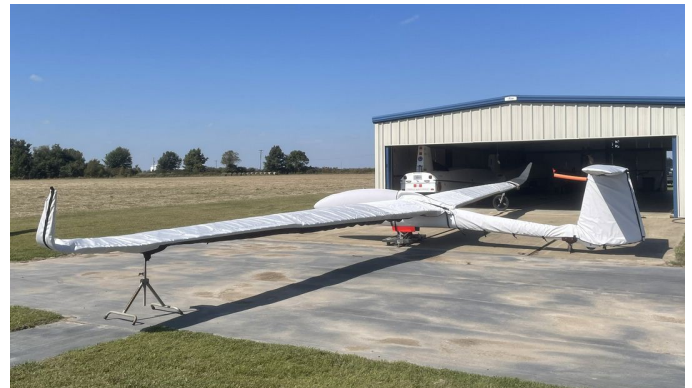
Pdps Pzl-Bielsko SZD-48-3