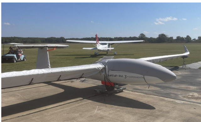
PdpS Pzl-Bielsko SZD-48-3