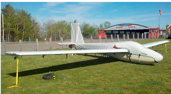
Schweizer 1-26B Canopy/Nose, Empennage & Wing Covers