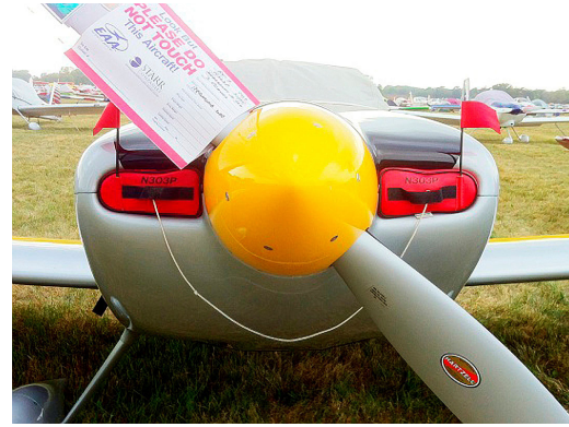
Vans's RV-7 Engine Engine Inlet Plugs