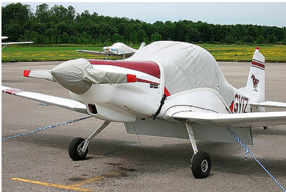
Bushby Mustang Canopy cover and Propellor/Spinner cover

This cover type is made from Silver Acrylic Sunbrella canvas and is 100% lined with a soft and smooth microfiber. Bruce's Custom Covers developed this material combination especially for aircraft protection. The outer material is medium weight and treated for water resistance, UV resistance and anti-static buildup. The inner lining is a very soft and smooth microfiber to prevent scratching. The material is very reflective, and tests show that the cabin interior temperature can be reduced to near-ambient temperature on the hottest of days. It is water, ice and snow repellent, yet breathable to allow moisture to escape from between the cover and the aircraft surface.