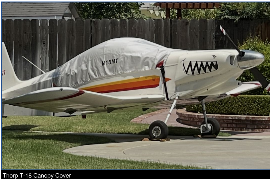
Thorp T-18 Canopy Cover