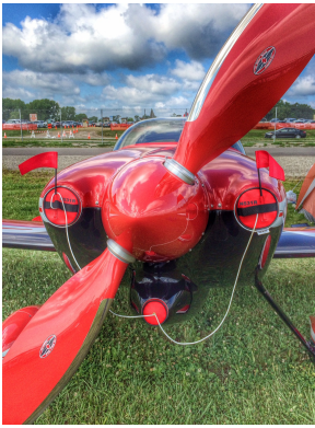
Van's RV-7 Engine Inlet Plugs