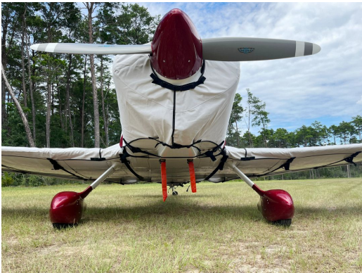
Bushby Mustang Complete Fuselage Cover with Detachable Wing Covers