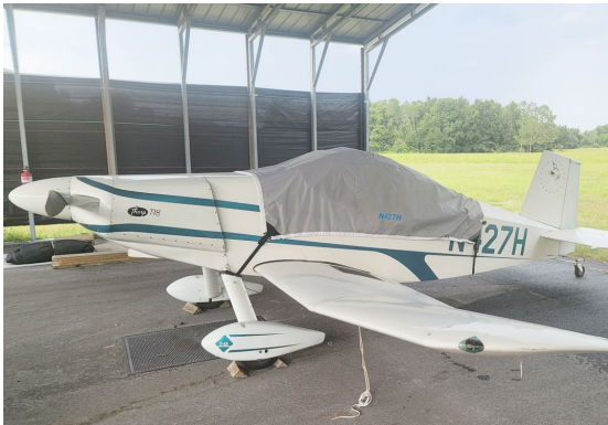
Thorp T-18 Travel Cover

Travel Covers are made with Silver Solution-Dyed Polyester fabric and only lined over the windshield to save weight. The material is lightweight and more compact for easy stowage in the aircraft. The polyester material is water resistant, but only intended for occasional use outside. We also have an ultra lightweight material available for fitted hangar dust covers. For daily outdoor use, the non-travel Sunbrella Cover is the best choice.