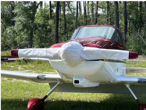
Mustang 2 Prop/Spinner Cover