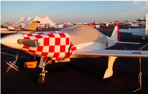
Thorp T-18 Canopy Cover

This cover type is made from Silver Acrylic Sunbrella canvas and is 100% lined with a soft and smooth microfiber. Bruce's Custom Covers developed this material combination especially for aircraft protection. The outer material is medium weight and treated for water resistance, UV resistance and anti-static buildup. The inner lining is a very soft and smooth microfiber to prevent scratching. The material is very reflective, and tests show that the cabin interior temperature can be reduced to near-ambient temperature on the hottest of days. It is water, ice and snow repellent, yet breathable to allow moisture to escape from between the cover and the aircraft surface.