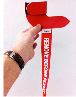
Standard Pitot Cover