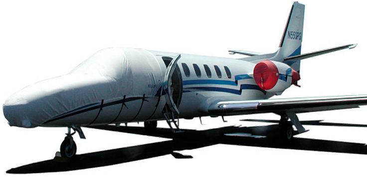
Cessna Citation Nose/Cockpit Cover, Engine Covers

This cover type is made from Silver Acrylic Sunbrella canvas and is 100% lined with a soft and smooth microfiber. Bruce's Custom Covers developed this material combination especially for aircraft protection. The outer material is medium weight and treated for water resistance, UV resistance and anti-static buildup. The inner lining is a very soft and smooth microfiber to prevent scratching. The material is very reflective, and tests show that the cabin interior temperature can be reduced to near-ambient temperature on the hottest of days. It is water, ice and snow repellent, yet breathable to allow moisture to escape from between the cover and the aircraft surface.