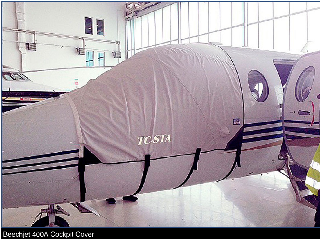
Beechjet 400A Cockpit Cover