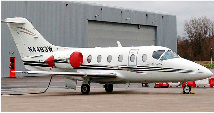
Beechjet 400 Engine Covers

of medium weight nylon which is available in a variety of colors to match the paint trim. Each cover set comes complete with installation and folding instructions. The aircraft's registration number can be silkscreened onto the cover for an extra charge.