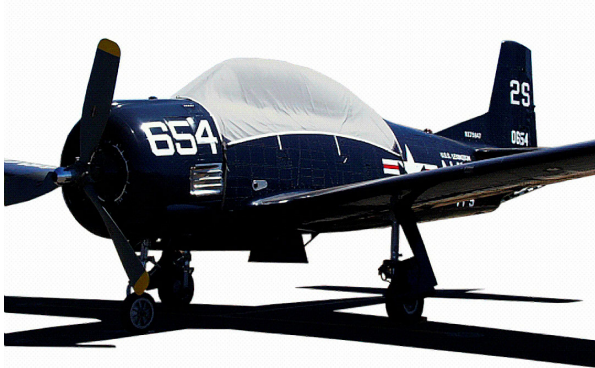
North American T28 Canopy Cover

This cover type is made from Silver Acrylic Sunbrella canvas and is 100% lined with a soft and smooth microfiber. Bruce's Custom Covers developed this material combination especially for aircraft protection. The outer material is medium weight and treated for water resistance, UV resistance and anti-static buildup. The inner lining is a very soft and smooth microfiber to prevent scratching. The material is very reflective, and tests show that the cabin interior temperature can be reduced to near-ambient temperature on the hottest of days. It is water, ice and snow repellent, yet breathable to allow moisture to escape from between the cover and the aircraft surface.