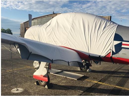
North American T28 Extended Canopy Cover

This cover type is made from Silver Acrylic Sunbrella canvas and is 100% lined with a soft and smooth microfiber. Bruce's Custom Covers developed this material combination especially for aircraft protection. The outer material is medium weight and treated for water resistance, UV resistance and anti-static buildup. The inner lining is a very soft and smooth microfiber to prevent scratching. The material is very reflective, and tests show that the cabin interior temperature can be reduced to near-ambient temperature on the hottest of days. It is water, ice and snow repellent, yet breathable to allow moisture to escape from between the cover and the aircraft surface.