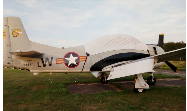
1957 North American T28C Canopy Cover