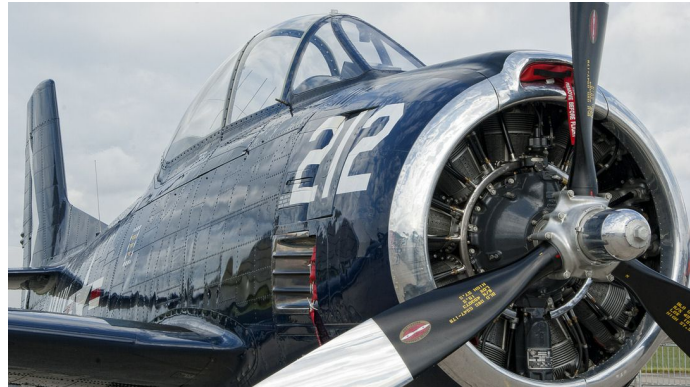
North American T28 Trojan Carb. Air Inlet Plug