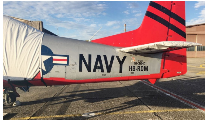
North American T28 Extended Canopy CoverT28 Horizontal Stabilizer Covers