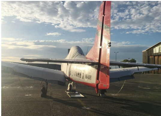
North American T28 Extended Canopy CoverT28 Wing Covers

WINTER USE MATERIAL - Made with Solution-Dyed Polyester fabric, this option is intended for seasonal use to aid in deicing, rain mitigation, or for occasional travel. The material is lighter and more compact, but more susceptible to UV damage and may have a shorter useful life if used continuously outside than the all-year use material.