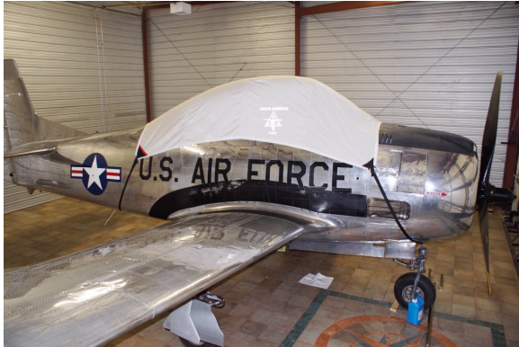
North American T-28 Canopy Cover

Travel Covers are made with Silver Solution-Dyed Polyester fabric and only lined over the windshield to save weight. The material is lightweight and more compact for easy stowage in the aircraft. The polyester material is water resistant, but only intended for occasional use outside. We also have an ultra lightweight material available for fitted hangar dust covers. For daily outdoor use, the non-travel Sunbrella Cover is the best choice.