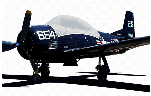
North American T28 Canopy Cover