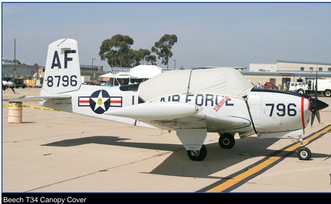
Beech T34 Canopy Cover