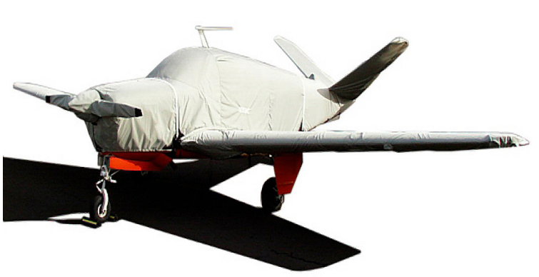
Beech Bonanza Full Cover Set