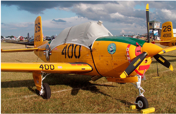
T34 Canopy Cover & Engine Inlet Plugs

of the plugs. Most plugs are imprinted with the aircraft registration number in black for an extra charge. Storage bag NOT included. Engine plugs may be inserted after flight when the engine is still warm. Engine Inlet Plugs are commonly referred to as Cowl Plugs, Intake Plugs, Cowl Blocks, Engine Blocks, and Engine Bungs.