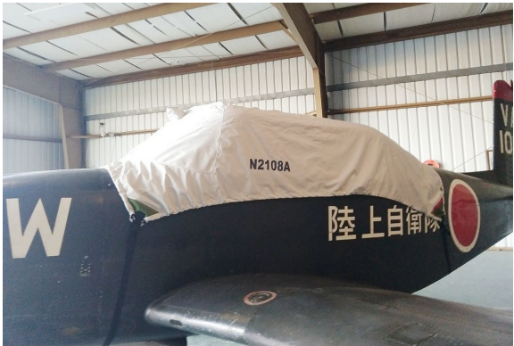
Fuji LM Canopy Cover