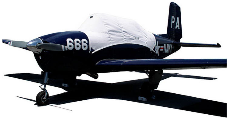
The T34 Canopy Cover