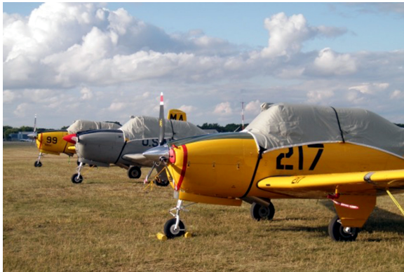
Beech T34 Canopy Cover

This cover type is made from Silver Acrylic Sunbrella canvas and is 100% lined with a soft and smooth microfiber. Bruce's Custom Covers developed this material combination especially for aircraft protection. The outer material is medium weight and treated for water resistance, UV resistance and anti-static buildup. The inner lining is a very soft and smooth microfiber to prevent scratching. The material is very reflective, and tests show that the cabin interior temperature can be reduced to near-ambient temperature on the hottest of days. It is water, ice and snow repellent, yet breathable to allow moisture to escape from between the cover and the aircraft surface.