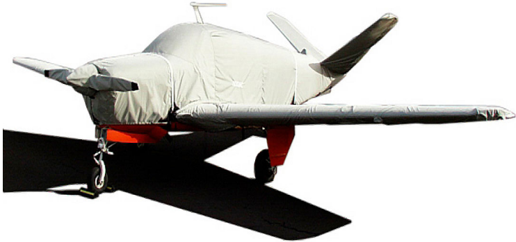
Beech Bonanza Full Cover Set

This cover type is made from Silver Acrylic Sunbrella canvas and is 100% lined with a soft and smooth microfiber. Bruce's Custom Covers developed this material combination especially for aircraft protection. The outer material is medium weight and treated for water resistance, UV resistance and anti-static buildup. The inner lining is a very soft and smooth microfiber to prevent scratching. The material is very reflective, and tests show that the cabin interior temperature can be reduced to near-ambient temperature on the hottest of days. It is water, ice and snow repellent, yet breathable to allow moisture to escape from between the cover and the aircraft surface.