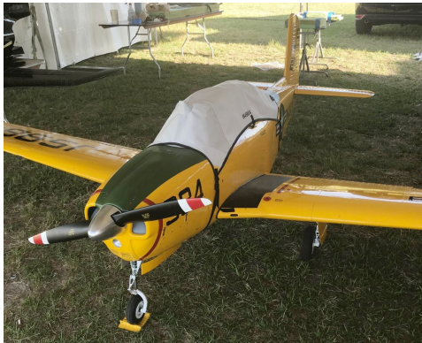
Beechcraft T-34B Mentor Canopy Cover, for 36% Scale Model

Travel Covers are made with Silver Solution-Dyed Polyester fabric and only lined over the windshield to save weight. The material is lightweight and more compact for easy stowage in the aircraft. The polyester material is water resistant, but only intended for occasional use outside. We also have an ultra lightweight material available for fitted hangar dust covers. For daily outdoor use, the non-travel Sunbrella Cover is the best choice.