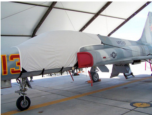
Northrup F5 Talon Canopy Cover