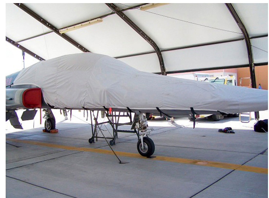
Northrop F5 Talon Canopy Cover