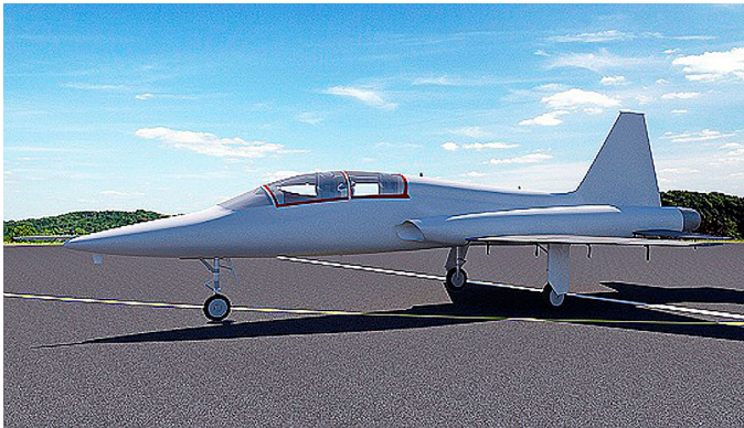
T-38 Talon Wing and Horizontal Stabilizer Covers (3D Rendering)

WINTER USE MATERIAL - Made with Solution-Dyed Polyester fabric, this option is intended for seasonal use to aid in deicing, rain mitigation, or for occasional travel. The material is lighter and more compact, but more susceptible to UV damage and may have a shorter useful life if used continuously outside than the all-year use material.