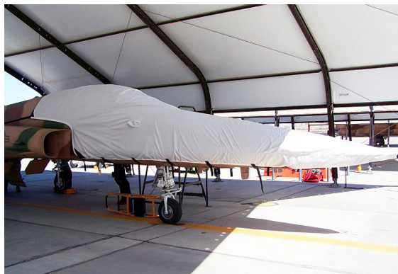
Northrop F-5 Talon Canopy/Nose Cover

Travel Covers are made with Silver Solution-Dyed Polyester fabric and only lined over the windshield to save weight. The material is lightweight and more compact for easy stowage in the aircraft. The polyester material is water resistant, but only intended for occasional use outside. We also have an ultra lightweight material available for fitted hangar dust covers. For daily outdoor use, the non-travel Sunbrella Cover is the best choice.