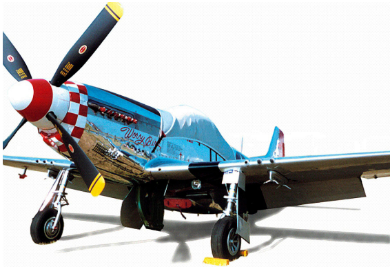
Canopy Cover, Belly & Chin Scoop Plugs