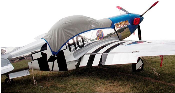
Stewart Mustang Canopy Cover, Prop Tie Downs & Intake Plugs Stewart Mustang Canopy Cover, Prop Tie Downs & Intake Plugs