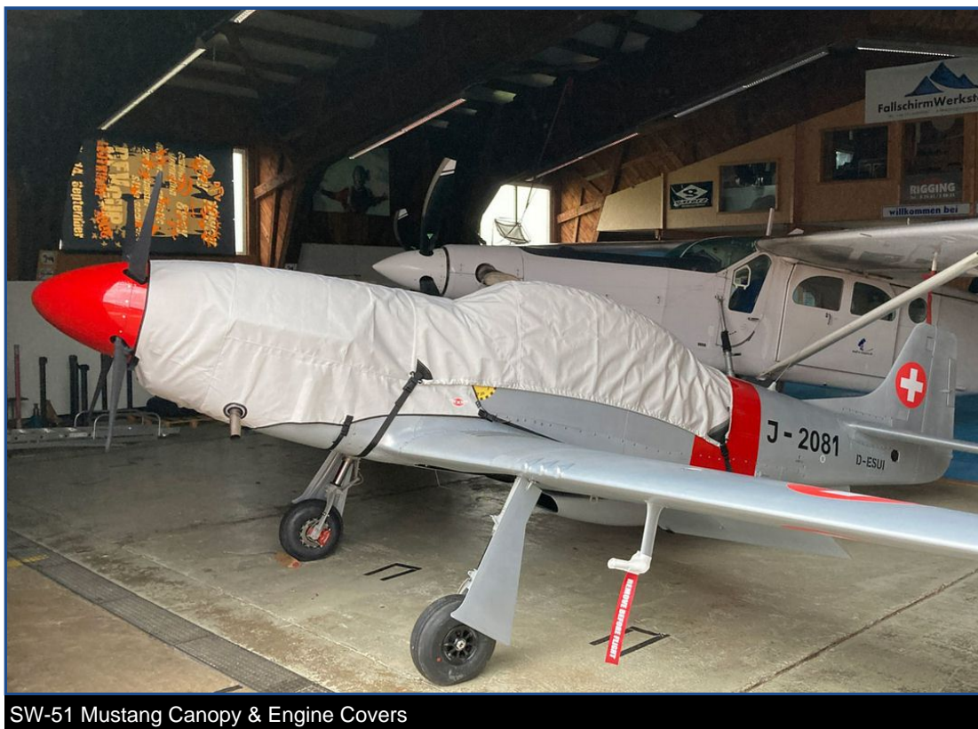
SW-51 Mustang Canopy &amp; Engine Covers