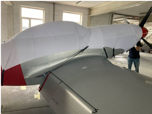
Scalewings SW-51 Mustang Canopy & Engine Covers, test fit covers

This cover type is made from Silver Acrylic Sunbrella canvas and is 100% lined with a soft and smooth microfiber. Bruce's Custom Covers developed this material combination especially for aircraft protection. The outer material is medium weight and treated for water resistance, UV resistance and anti-static buildup. The inner lining is a very soft and smooth microfiber to prevent scratching. The material is very reflective, and tests show that the cabin interior temperature can be reduced to near-ambient temperature on the hottest of days. It is water, ice and snow repellent, yet breathable to allow moisture to escape from between the cover and the aircraft surface.