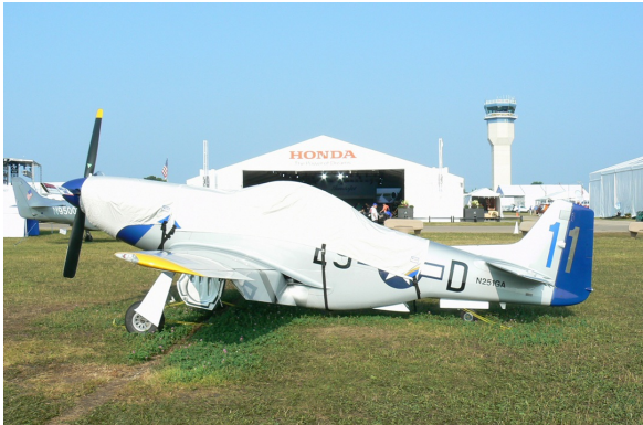
Thunder Mustang Canopy & Engine Cover