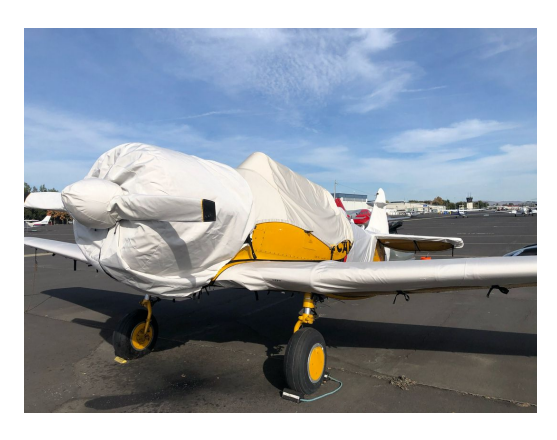
North American T6 Prop, Engine & Wing Covers