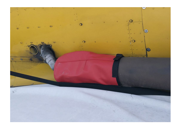
North American T6 Exhaust Cover, cold weather type

This cover type is made from Silver Acrylic Sunbrella canvas and is 100% lined with a soft and smooth microfiber. Bruce's Custom Covers developed this material combination especially for aircraft protection. The outer material is medium weight and treated for water resistance, UV resistance and anti-static buildup. The inner lining is a very soft and smooth microfiber to prevent scratching. The material is very reflective, and tests show that the cabin interior temperature can be reduced to near-ambient temperature on the hottest of days. It is water, ice and snow repellent, yet breathable to allow moisture to escape from between the cover and the aircraft surface.