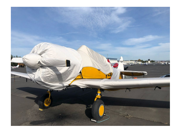
North American T6 Prop, Engine & Wing Covers

WINTER USE MATERIAL - Made with Solution-Dyed Polyester fabric, this option is intended for seasonal use to aid in deicing, rain mitigation, or for occasional travel. The material is lighter and more compact, but more susceptible to UV damage and may have a shorter useful life if used continuously outside than the all-year use material.