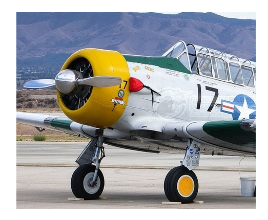
North American T6 Carb Air Scoop Cover