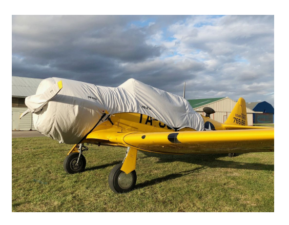
North American T6 Canopy Cover with 30" fwd ext (multi piece back glass), Engine & Prop Covers