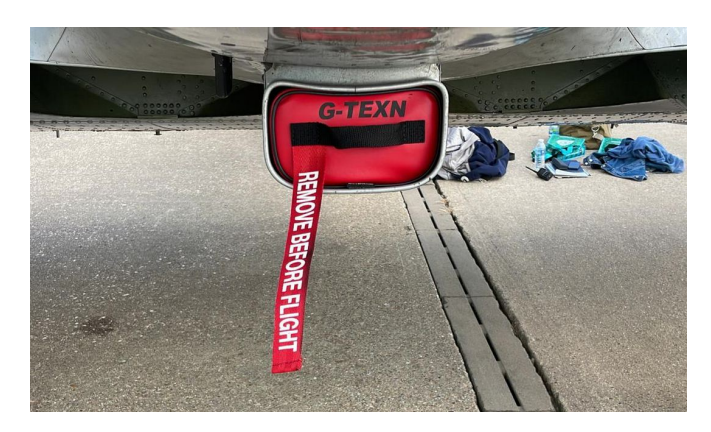
T6 Harvard Chin Scoop Plug

Engine Inlet Plugs are custom fit for your North American T6, SNJ, Harvard intakes, made with heavy-duty vinyl material, and stuffed with a single block of sculpted urethane foam. Each plug has a zipper that allows the foam to be removed and dried if necessary. Engine plugs have warning flags that are visible from the cockpit or 'remove before flight' streamers sewn onto the face of the plugs. Most plugs are imprinted with the aircraft registration number in black for an extra charge. Storage bag NOT included. Engine plugs may be inserted after flight when the engine is still warm. Engine Inlet Plugs are commonly referred to as Cowl Plugs, Intake Plugs, Cowl Blocks, Engine Blocks, and Engine Bungs.