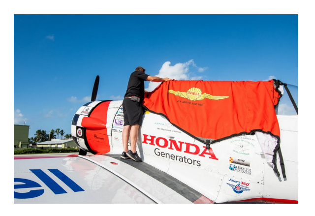
North American T6 Canopy Cover w/30" fwd Extension