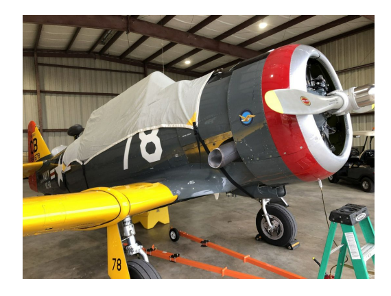
North American T6 Canopy Cover w/30" fwd bib

This cover type is made from Silver Acrylic Sunbrella canvas and is 100% lined with a soft and smooth microfiber. Bruce's Custom Covers developed this material combination especially for aircraft protection. The outer material is medium weight and treated for water resistance, UV resistance and anti-static buildup. The inner lining is a very soft and smooth microfiber to prevent scratching. The material is very reflective, and tests show that the cabin interior temperature can be reduced to near-ambient temperature on the hottest of days. It is water, ice and snow repellent, yet breathable to allow moisture to escape from between the cover and the aircraft surface.