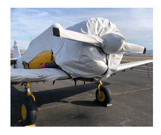
North American T6 Prop & Engine Covers