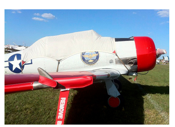
T6 Pitot, Canopy & Prop Covers