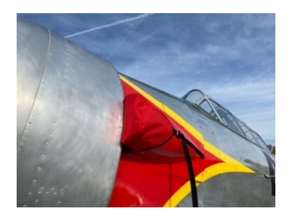
North American T6 Carb Air Scoop Cover